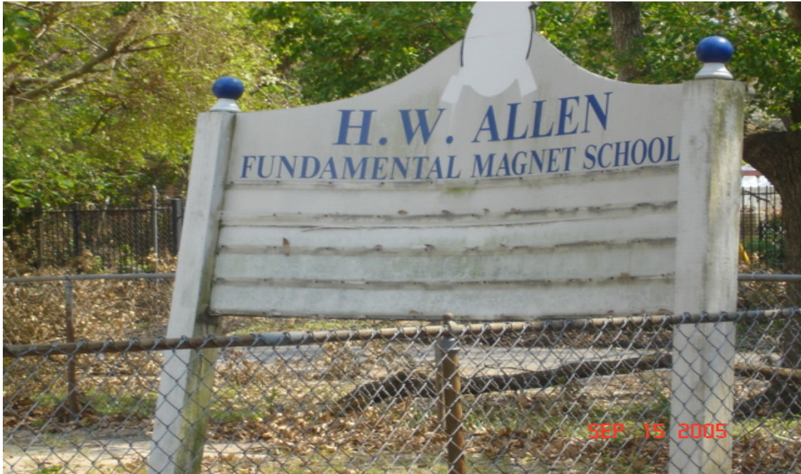
School sign damage