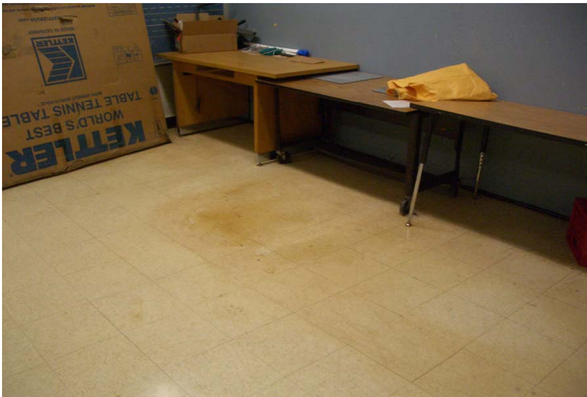
Water damage on floor