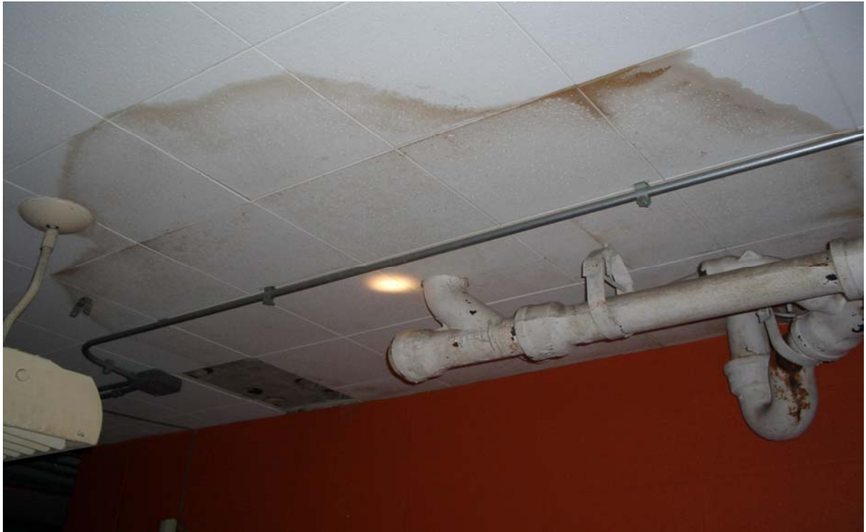
Water damage in ceiling tile