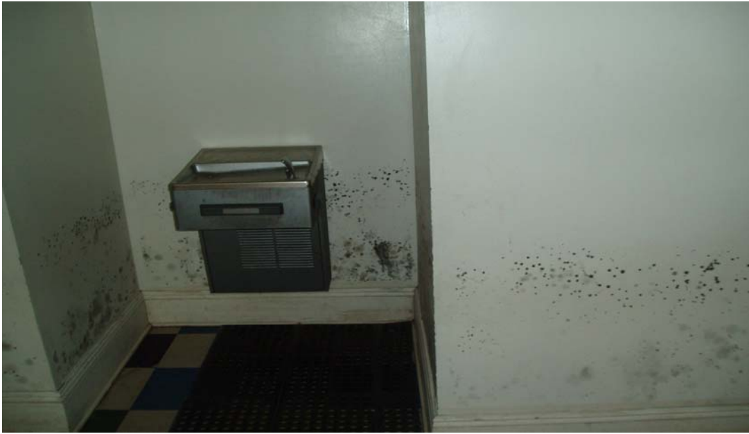
Water damage and mold