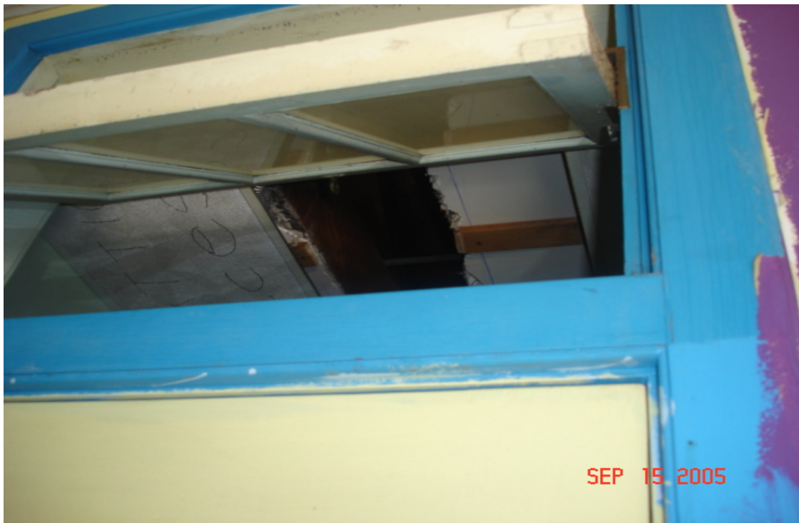
Classroom ceiling damage