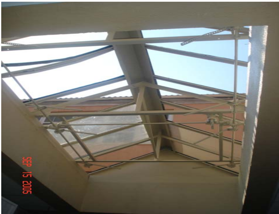
Skylight blown out