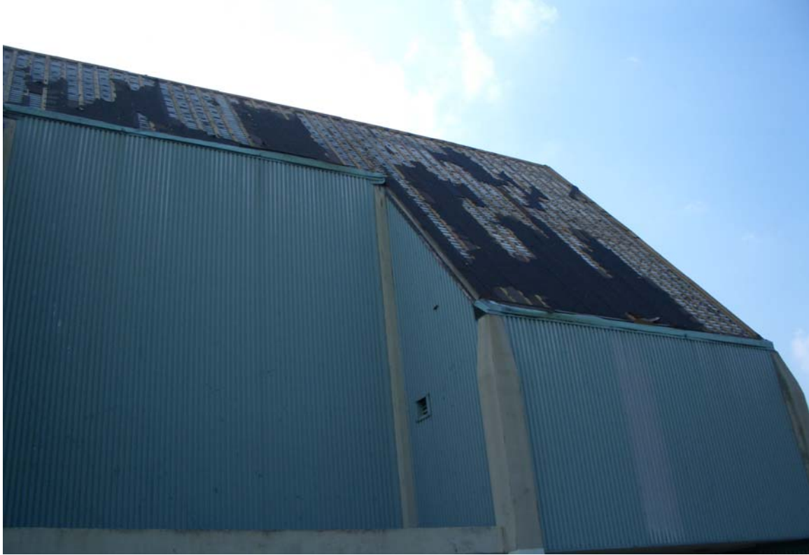
Roof damage to auditorium