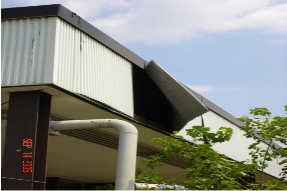
Roof fascia damage on cafeteria building