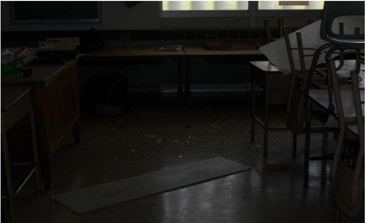
Window Plexiglas and glass blown into classroom