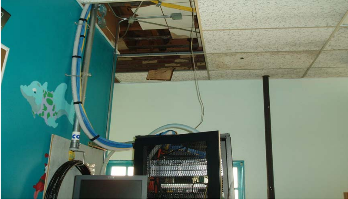
Ceiling water damage