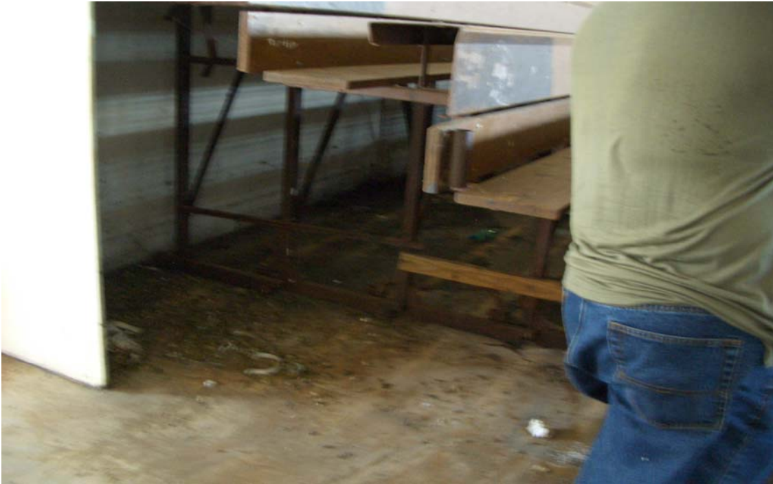
Water damage under bleachers in gym