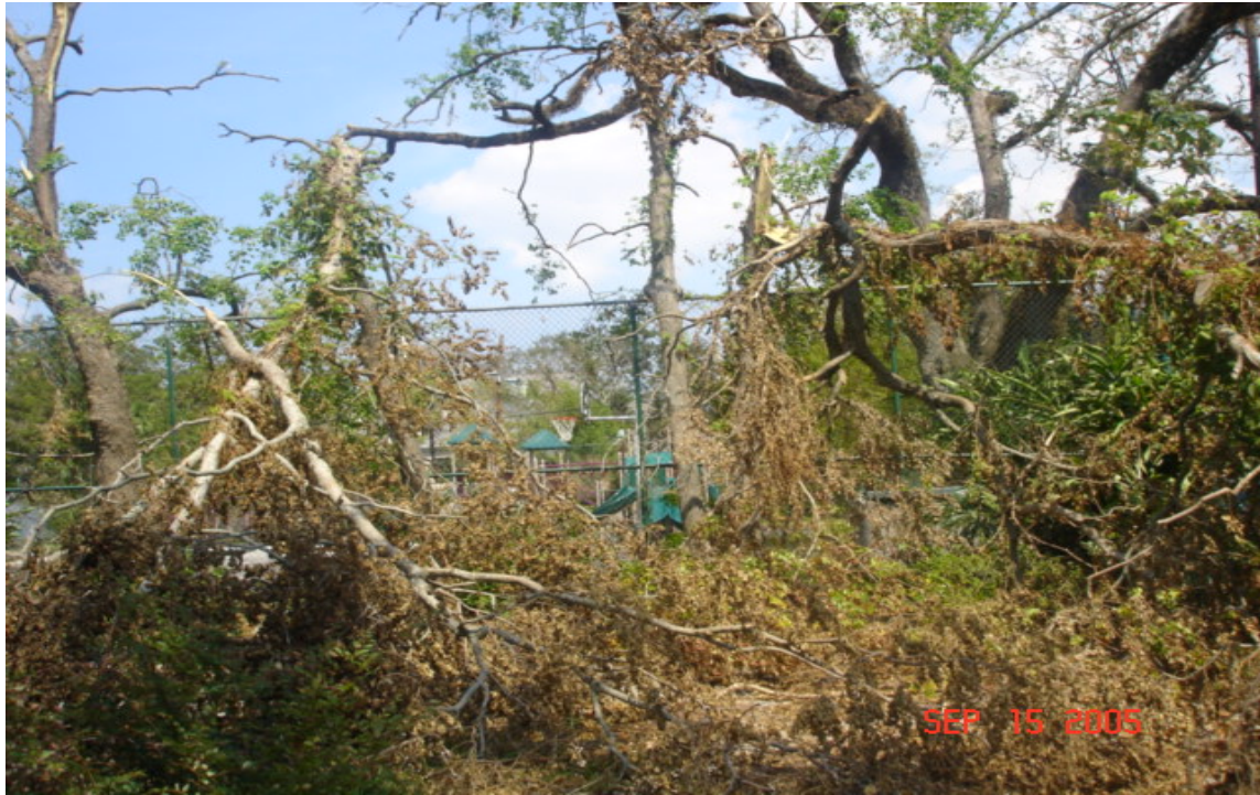
Tree damage, front yard