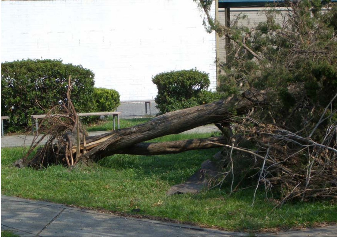
Tree down on school grounds