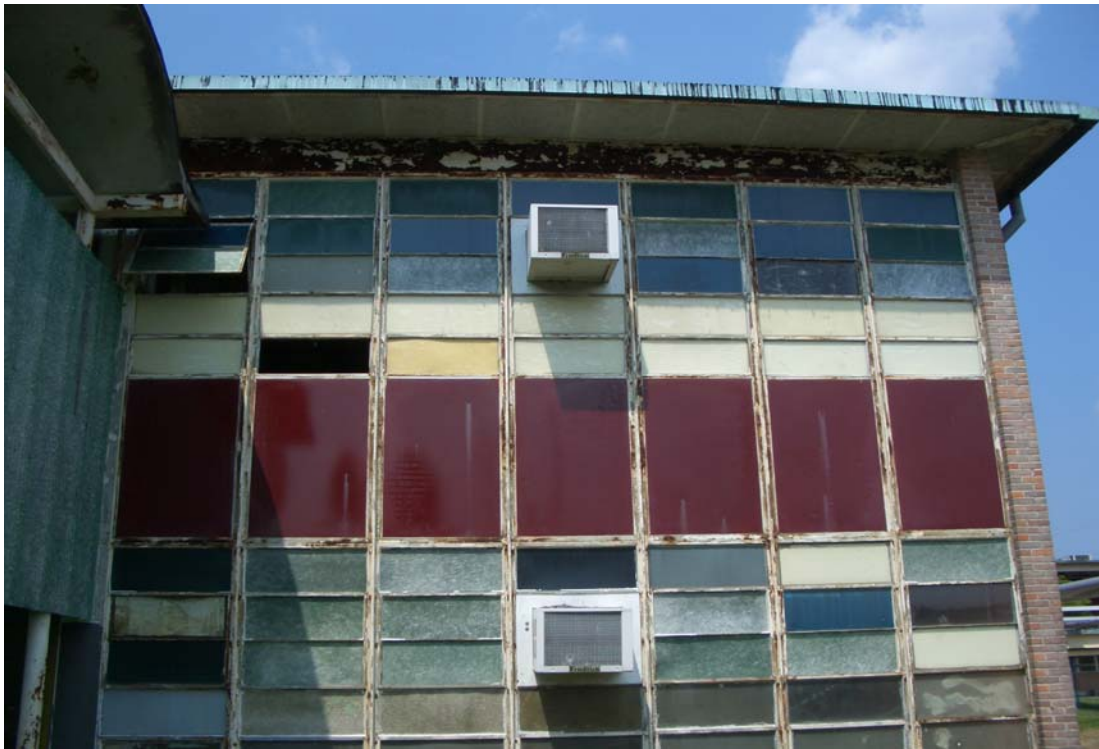
Broken windows and glazing off