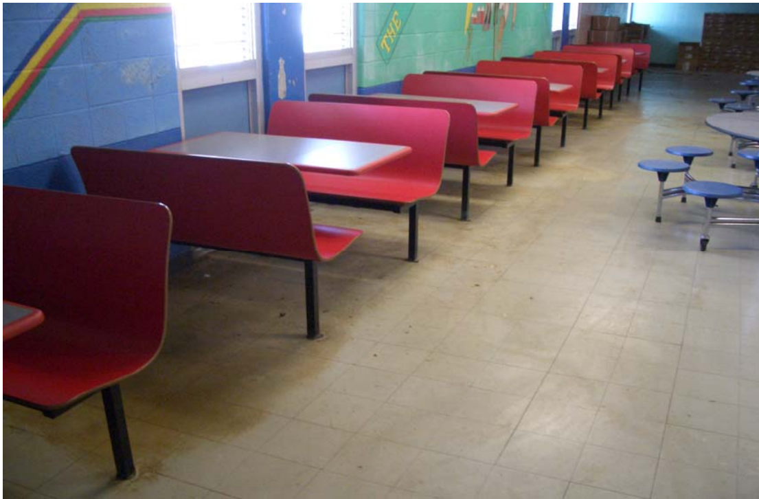
Water damage on floor in cafeteria