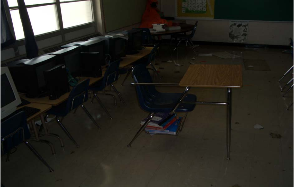
Debris scattered from broken window and computers near window and standing water