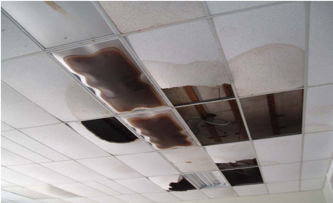
Water damage to ceiling