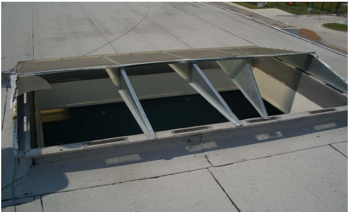
Blown out skylight glass on school roof