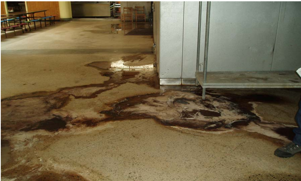
Water damage to floor