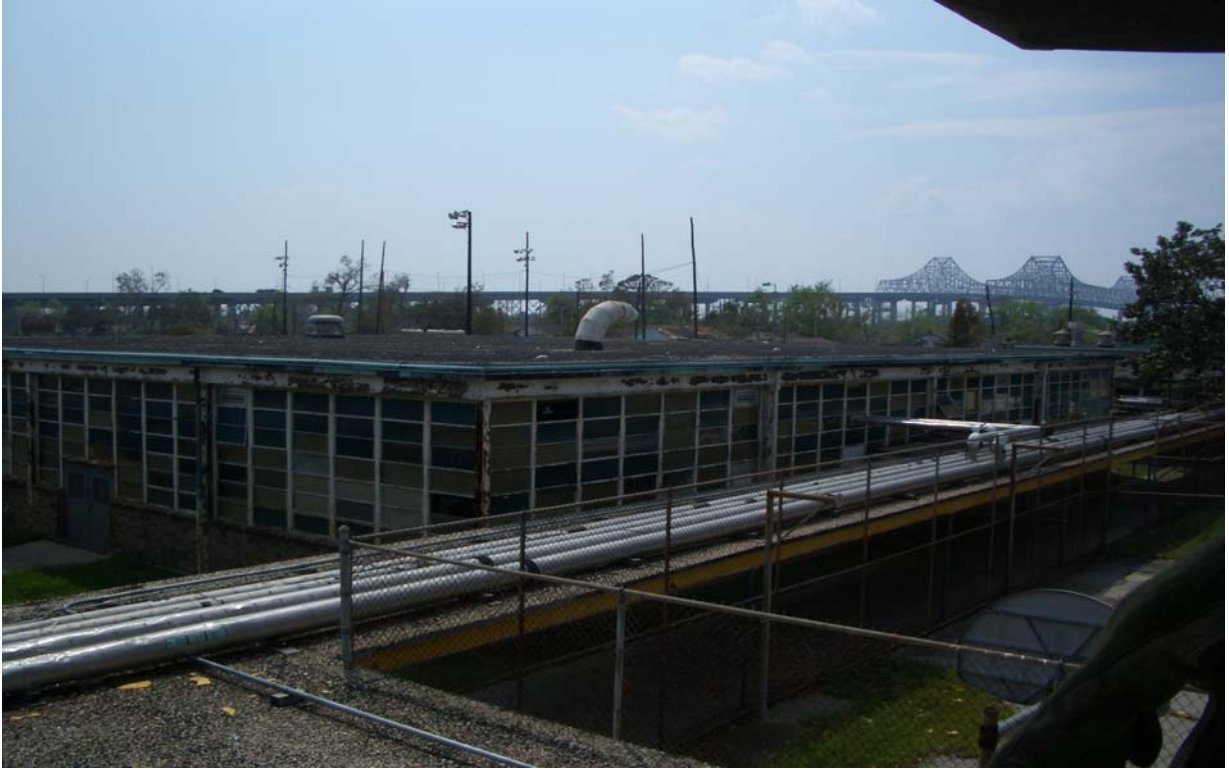
Damage to glazing and roof penetrations