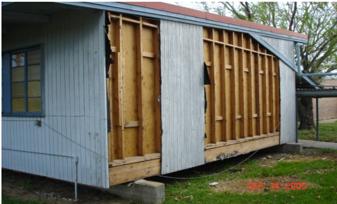
Siding torn off portable