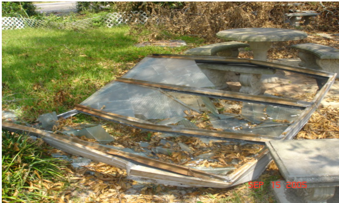
Skylight blown off