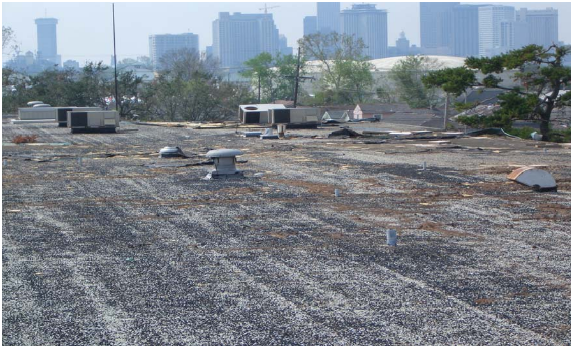
Damage to roof and penetrations over classrooms