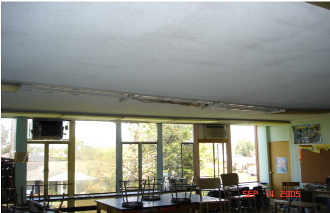
Damaged Ceiling – Room not safe to occupy