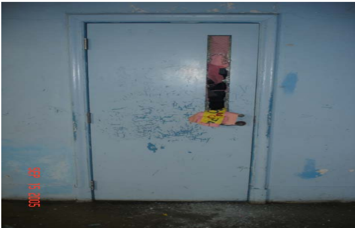
Vandalism in basement