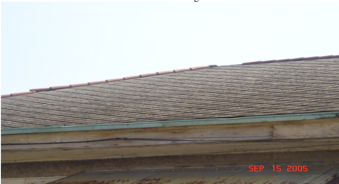
Roof ridge tile damage