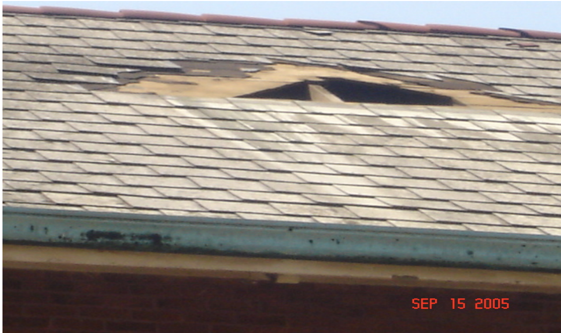
Roof vent blown off