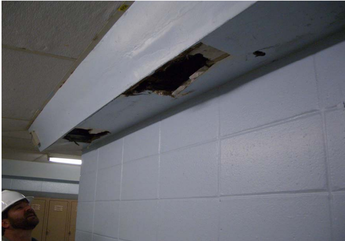
Water damage in duct, evidence of mold