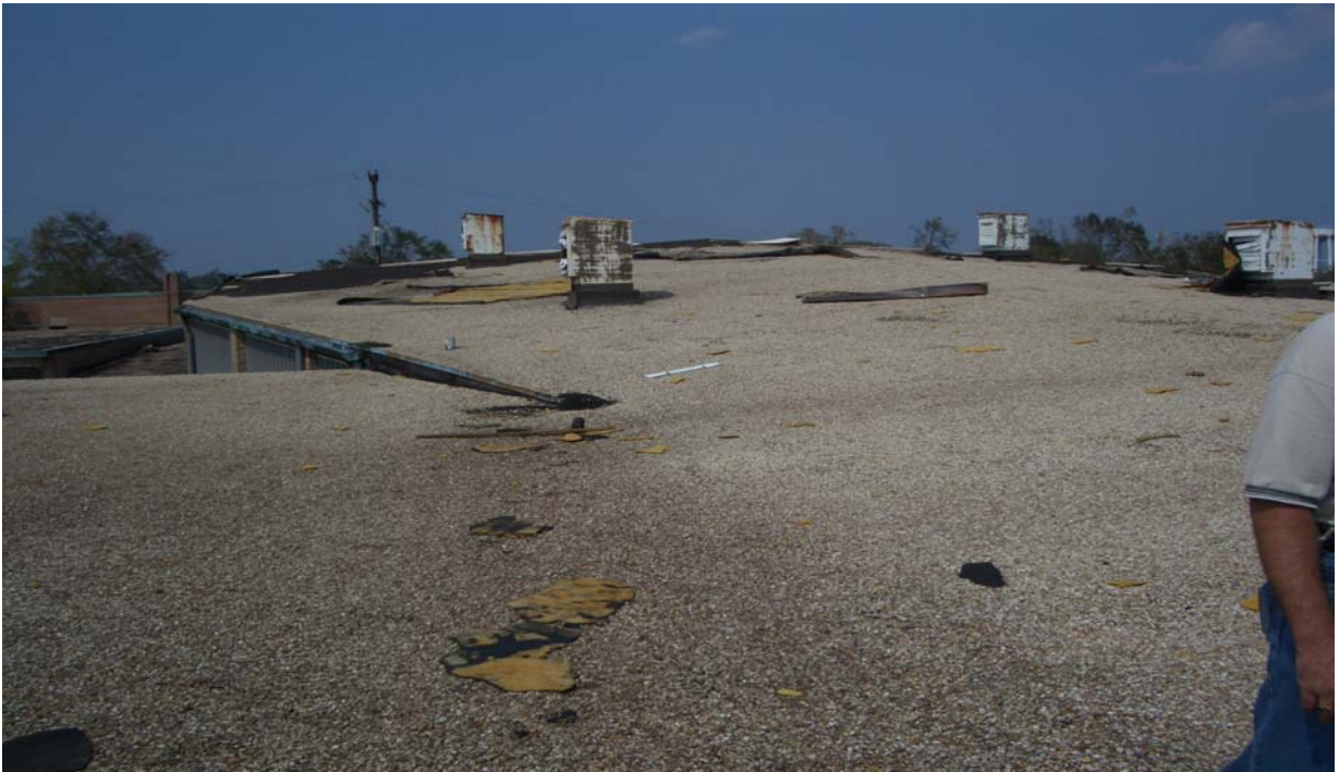
Damage to roof of auditorium