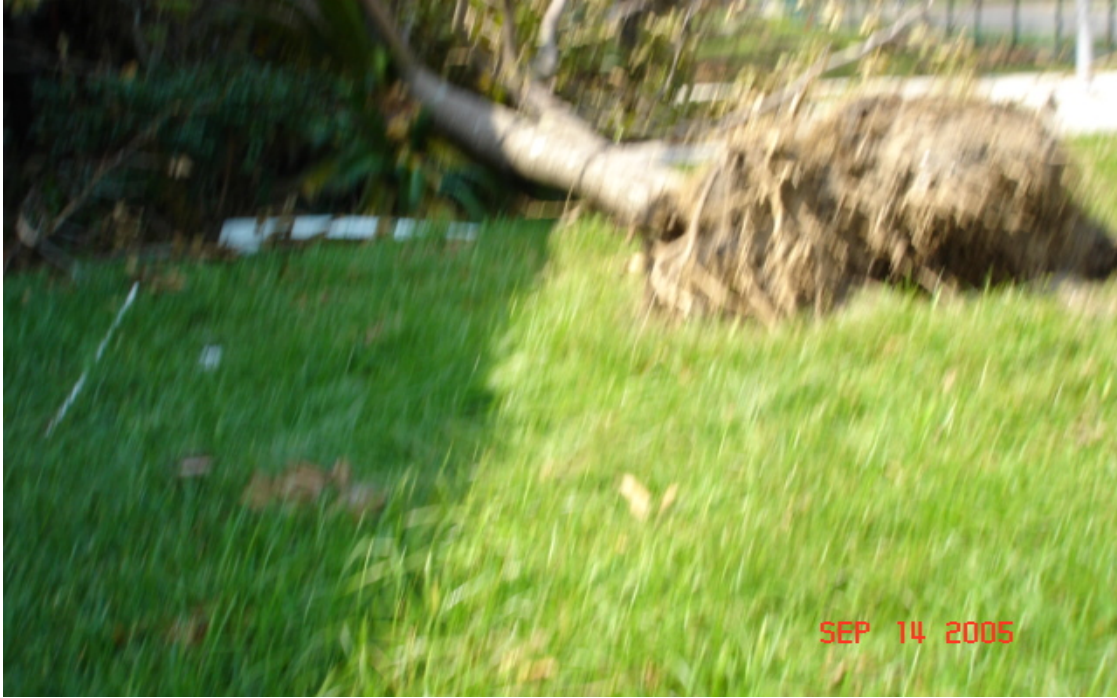
Fallen tree against building