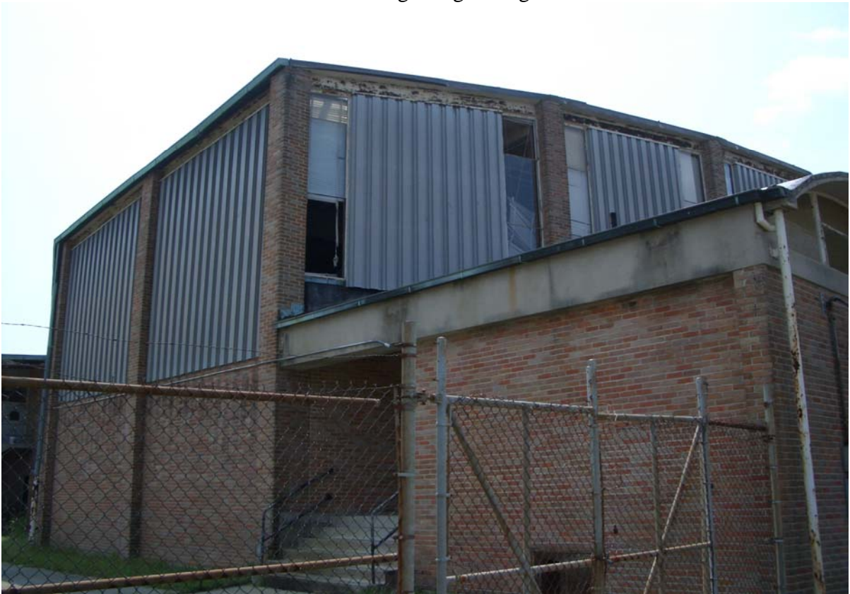
Window damage to auditorium