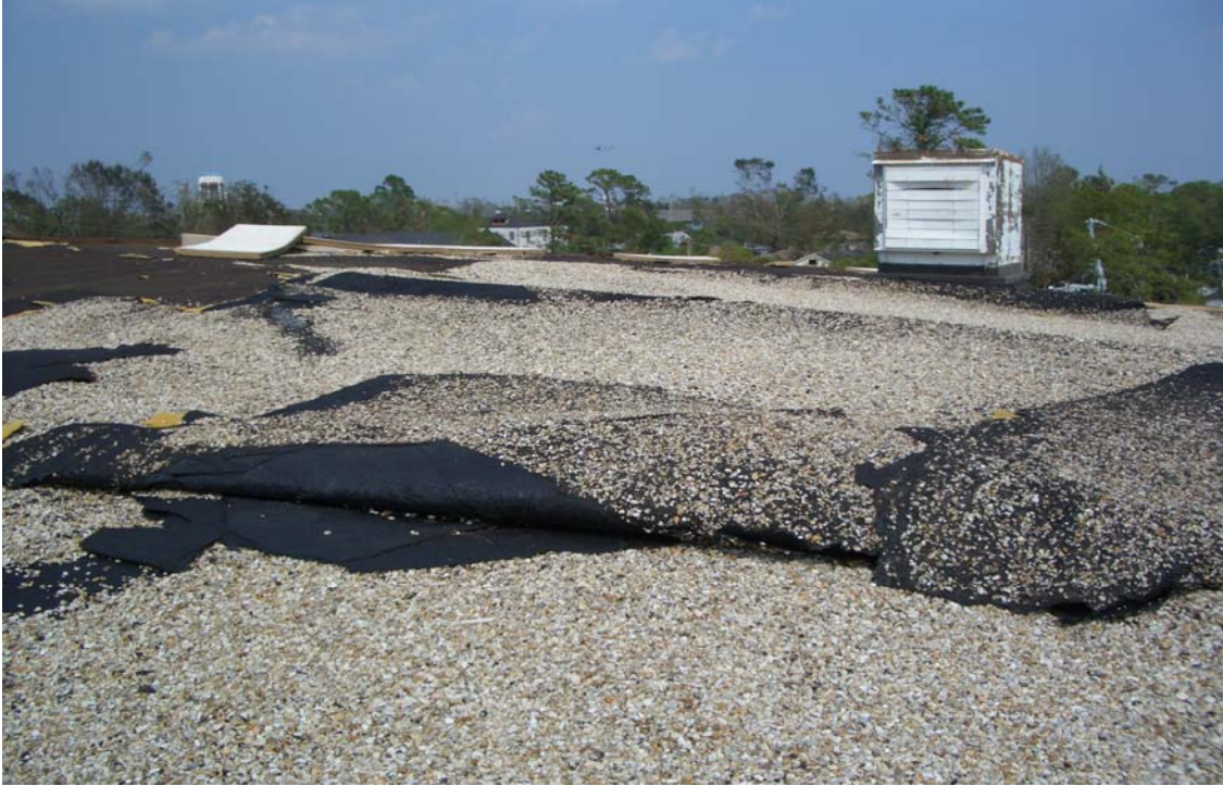
Damage to roof of auditorium