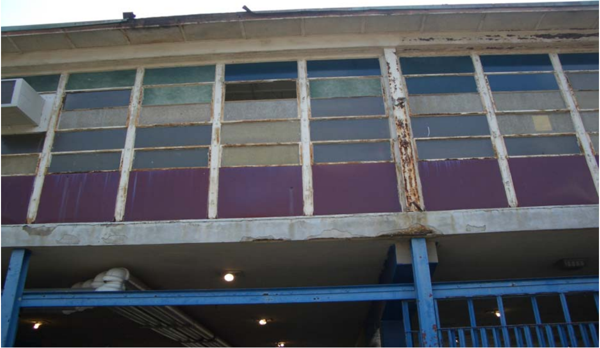
Window and glazing damage