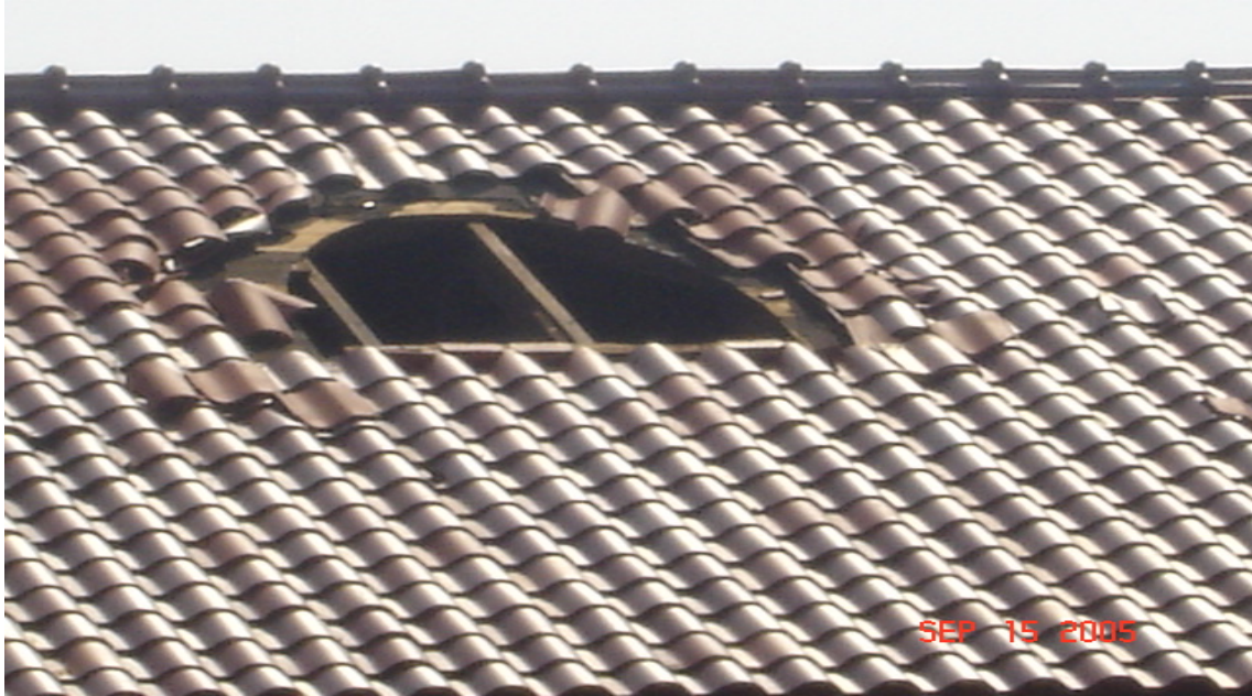
Roof vent blown off