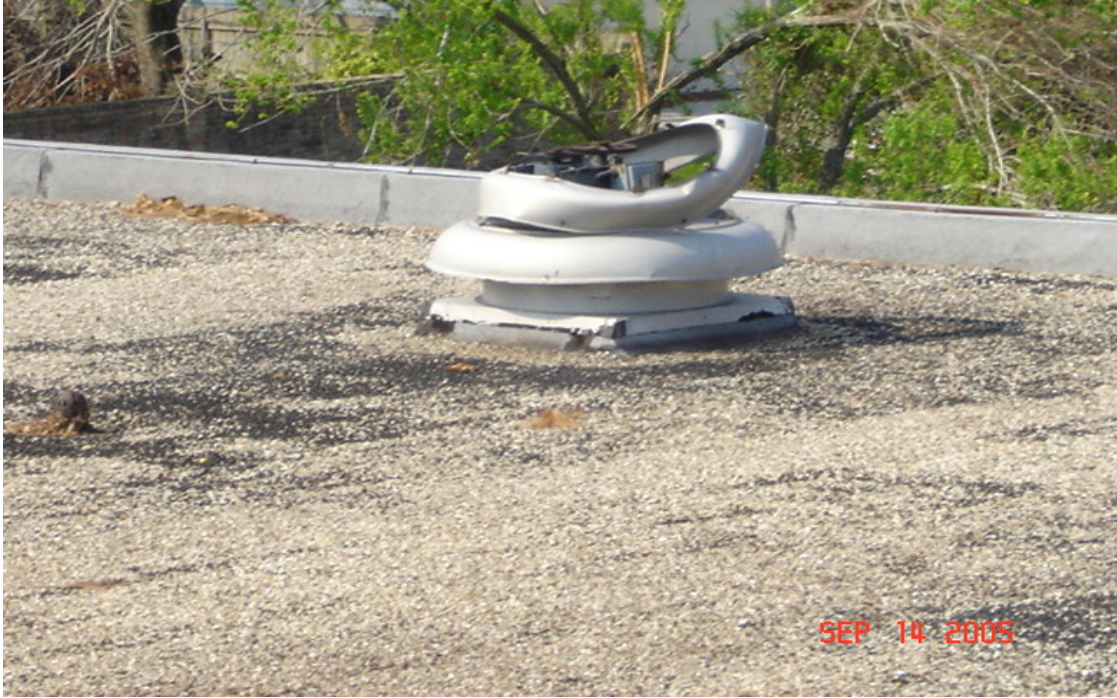
Damaged exhaust fan