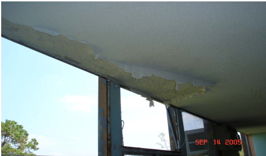
Ceiling damaged by wind & water