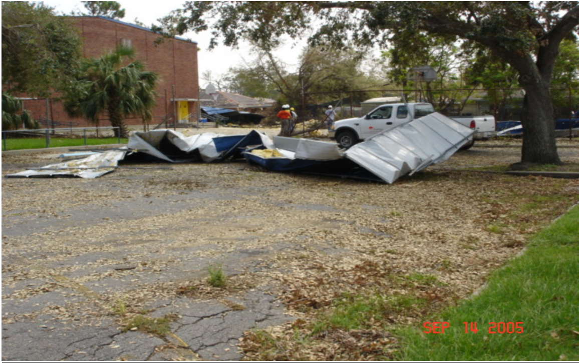
Standing Seam Metal Roof off Gym