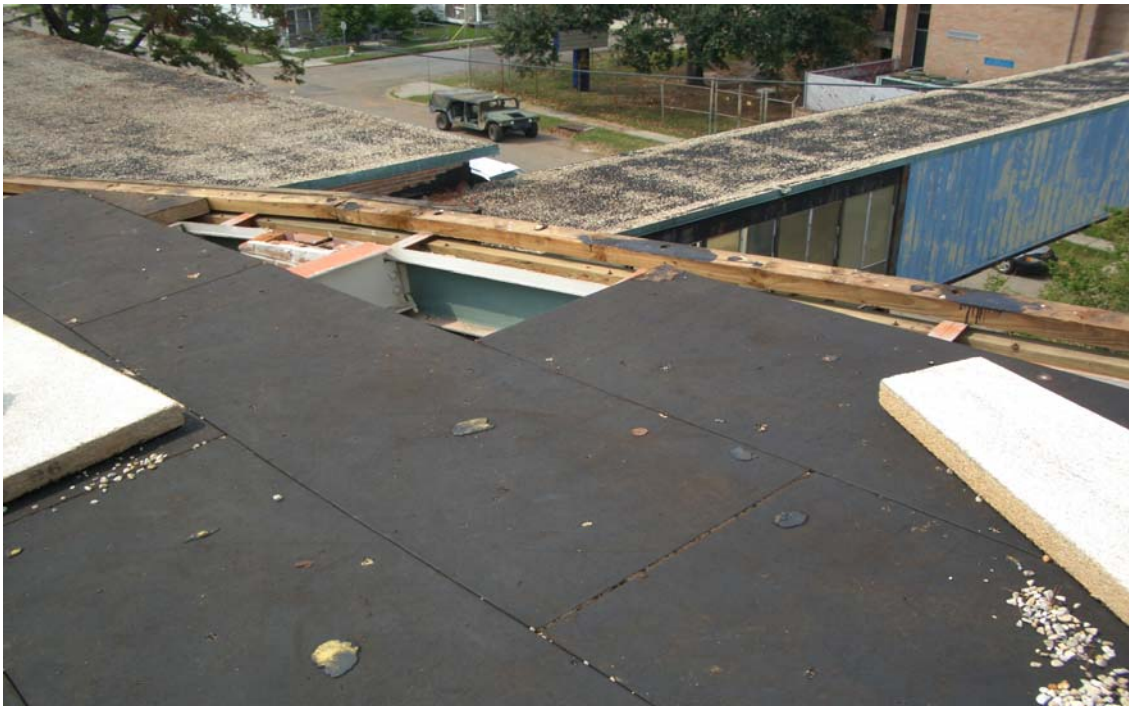
Damage to roof of auditorium