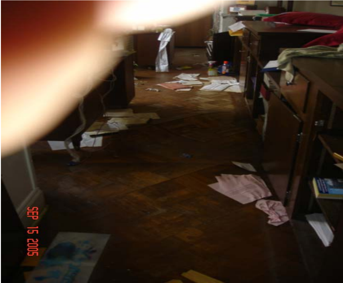
Parquet floor buckled, office