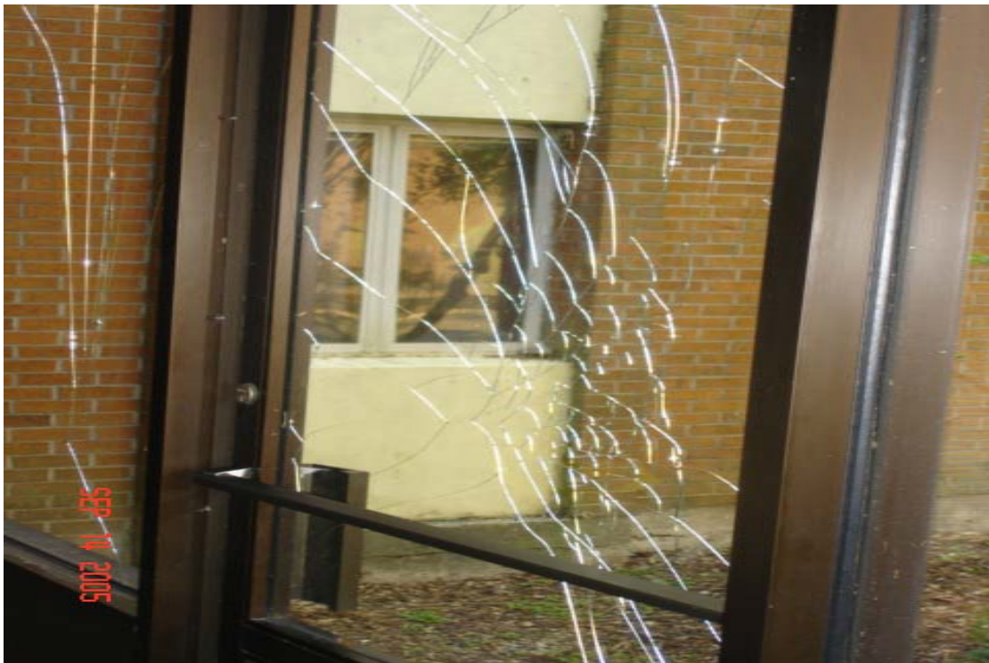
Broken window, courtyard door