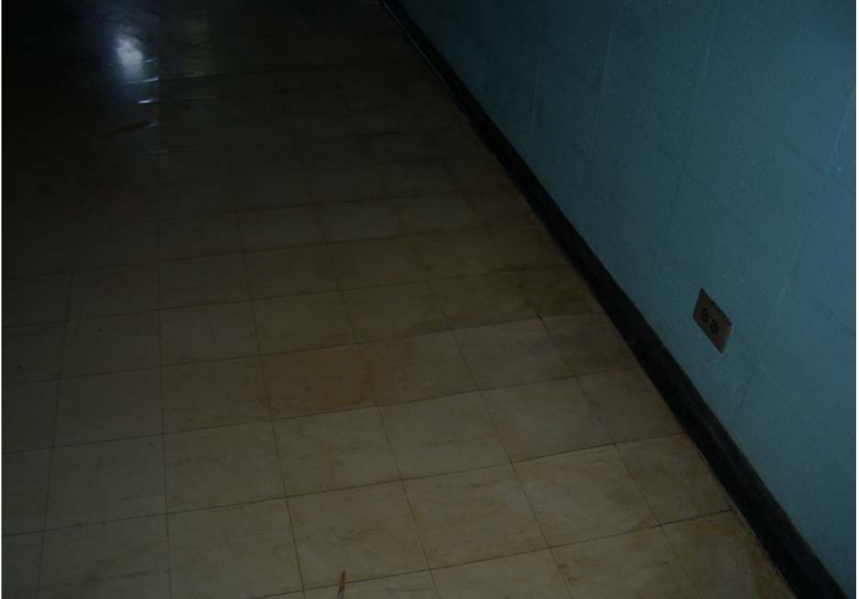
Water damage on hallway floor