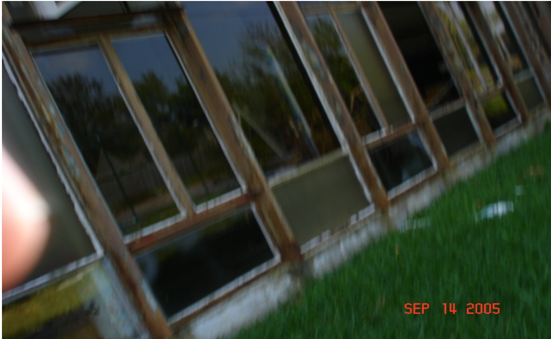
Examples of multiple broken windows