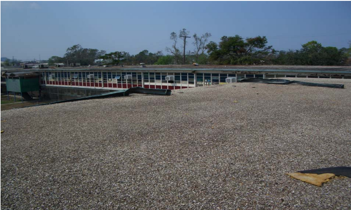
Gutters blown up onto roof