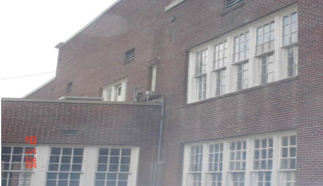
Downspout torn off, moisture entering building