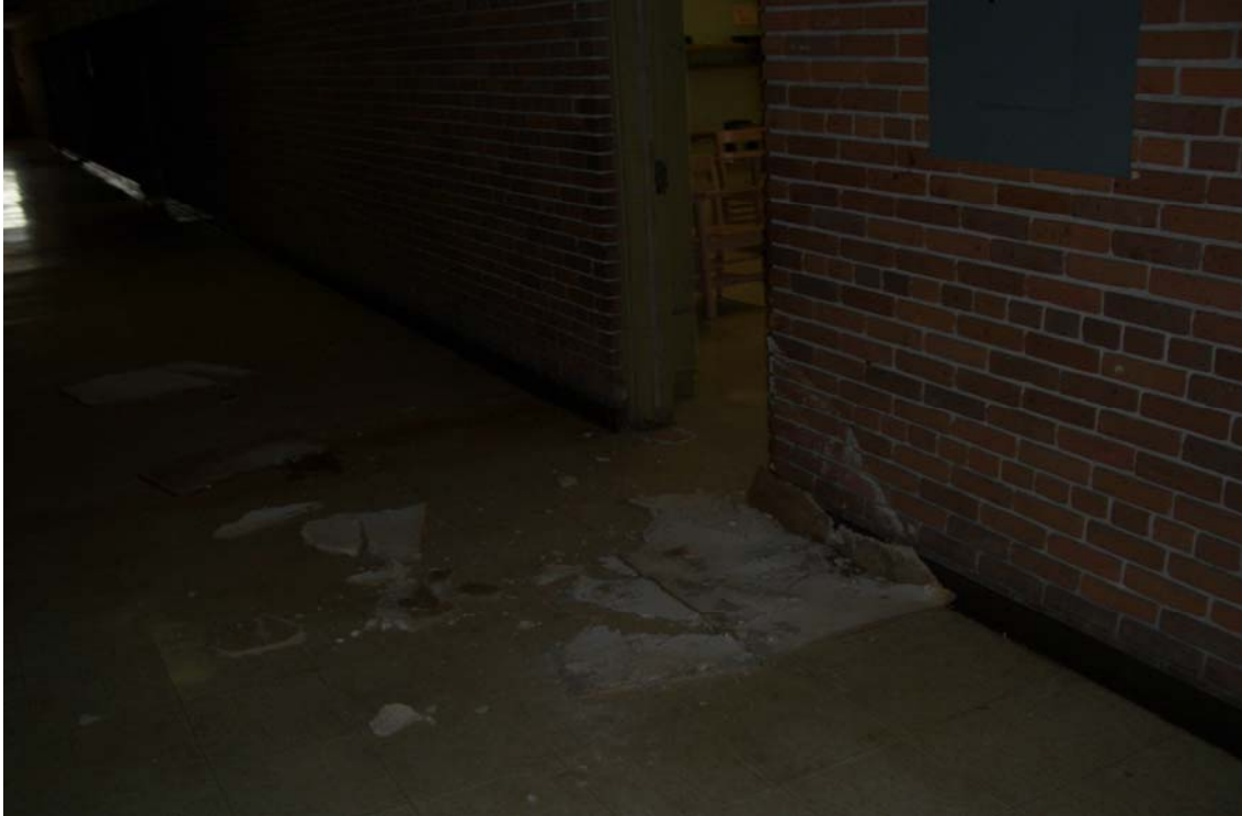
Water damage to ceiling and wall outside classroom