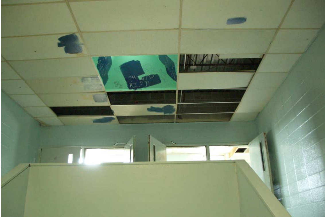
Ceiling tile out in stairwell