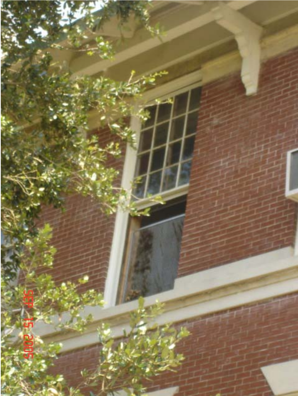
Window blown out