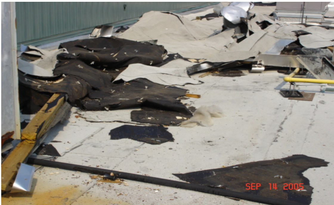
Cafeteria roof damage