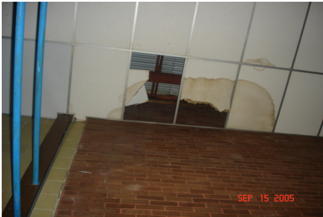
Wet, damaged ceiling tile