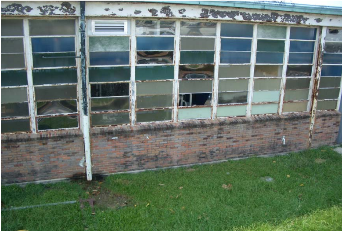
Windows out in gym