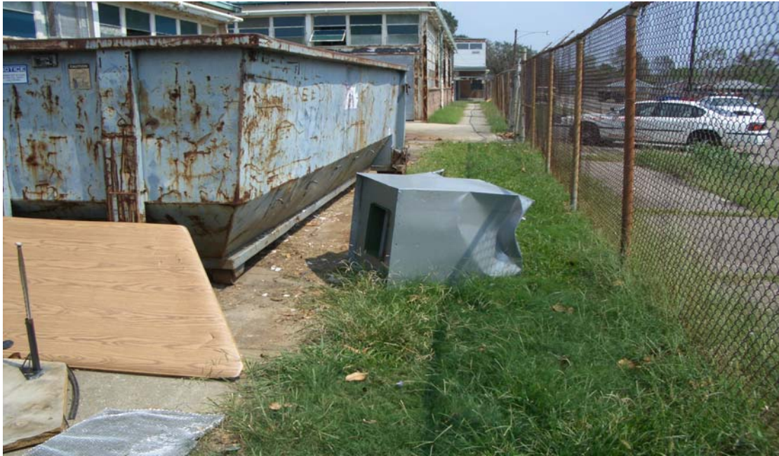
Unit blown off roof