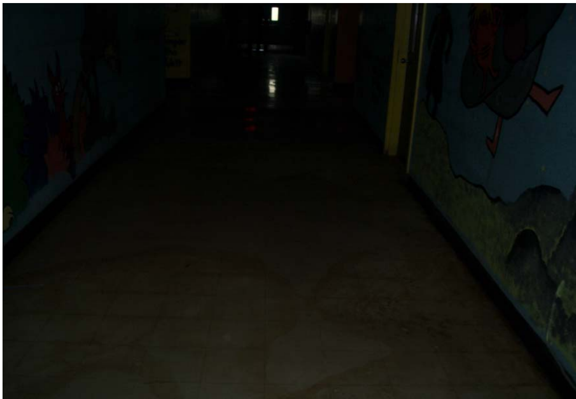
Water damage in hallway floor