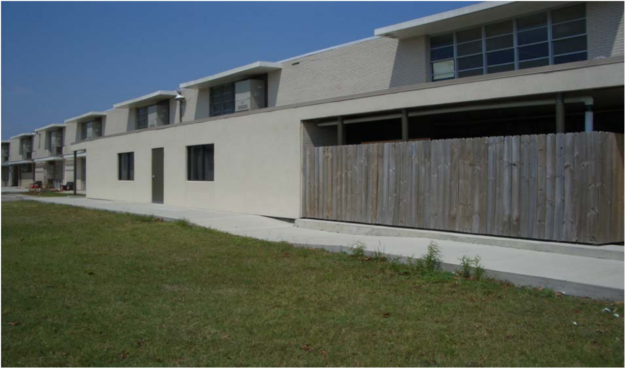
Evidence of cracks in outer walls and missing bricks