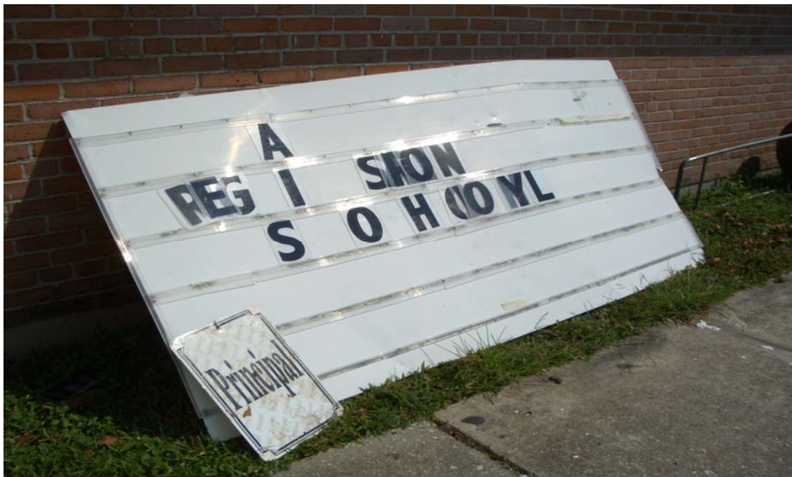
School sign down