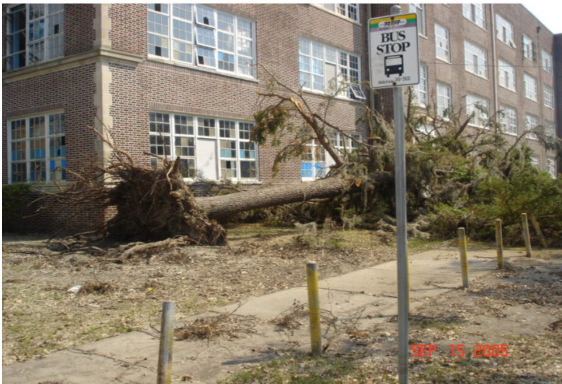
Tree down, front of building