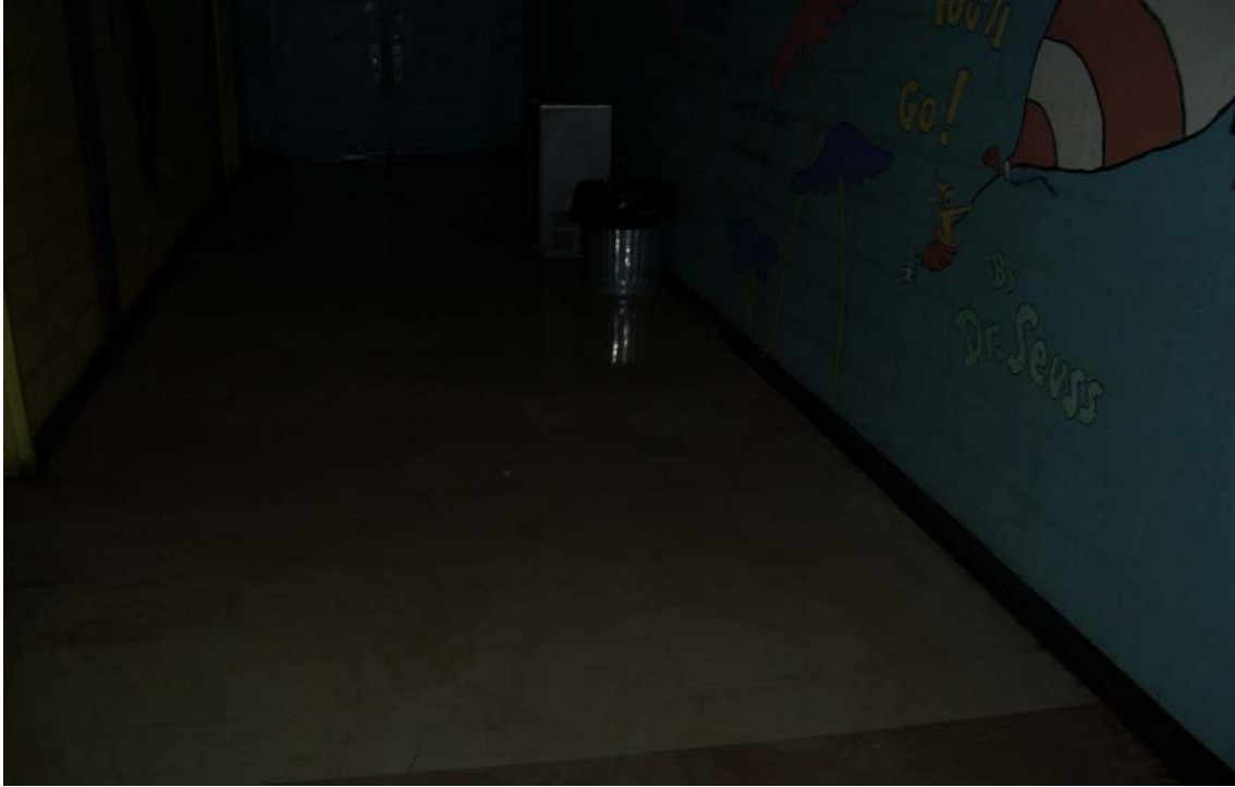
Water damage on hallway floor