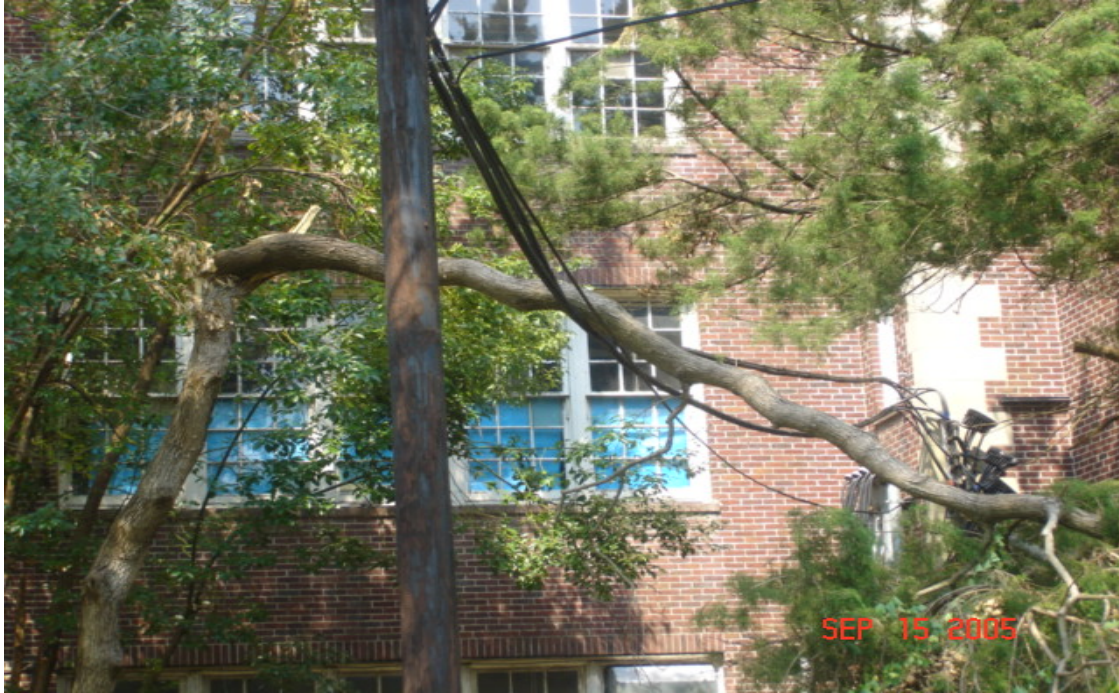
Tree limb on primary power supply line to building