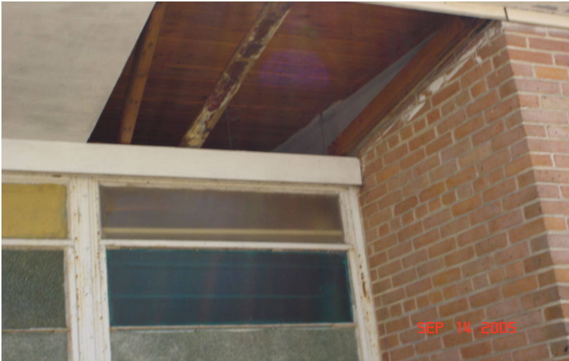
Soffit missing, front