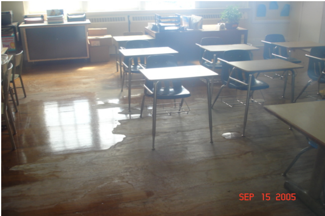
Water in classroom