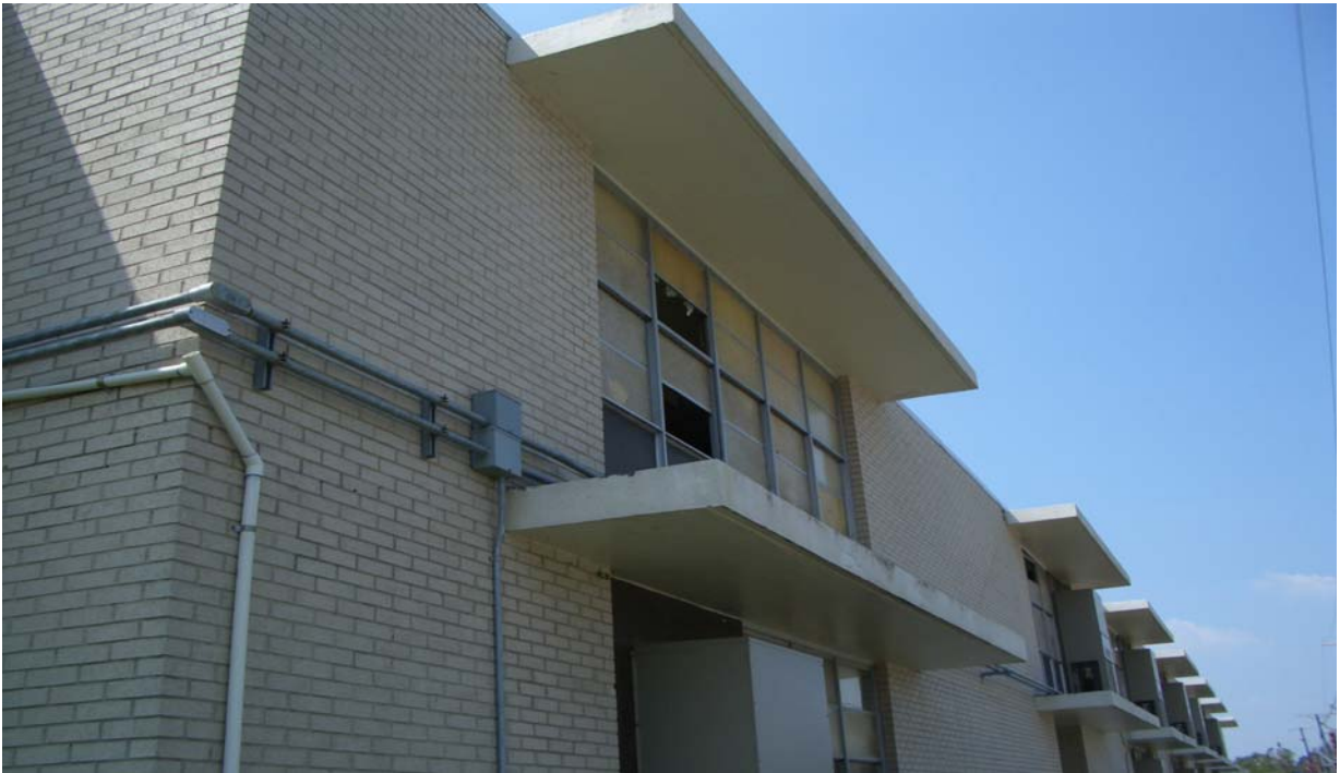
Blown out windows on storm side of building