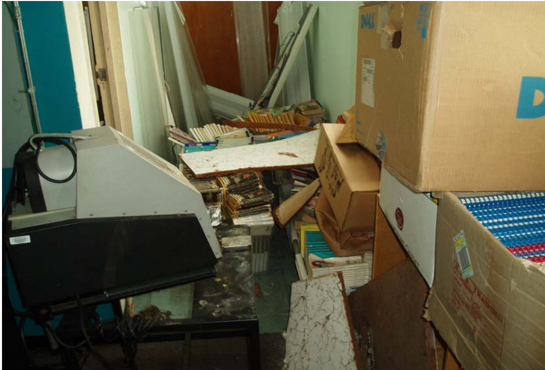
Ceiling tile down and water on floor