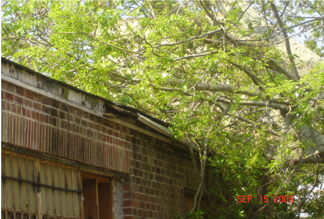
Tree on gym roof