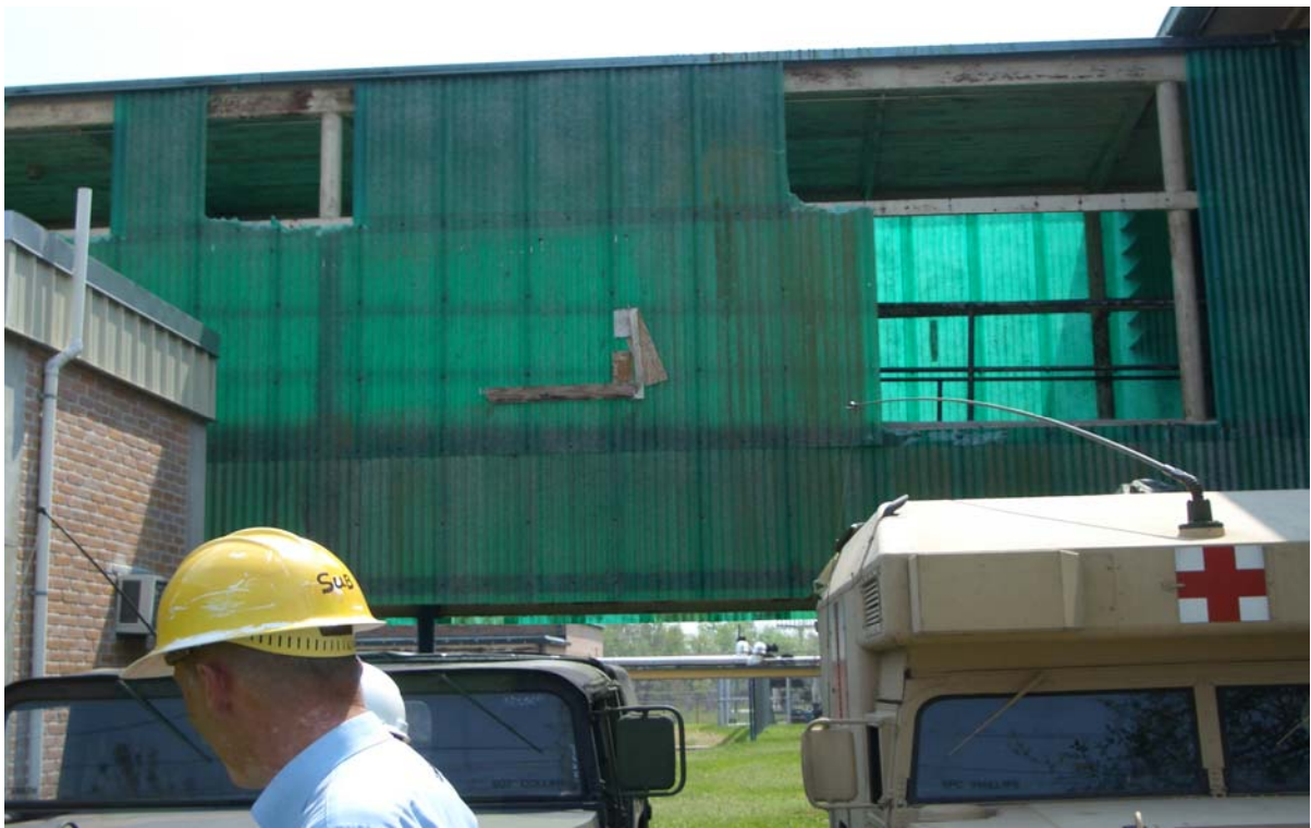
Breezeway blown out