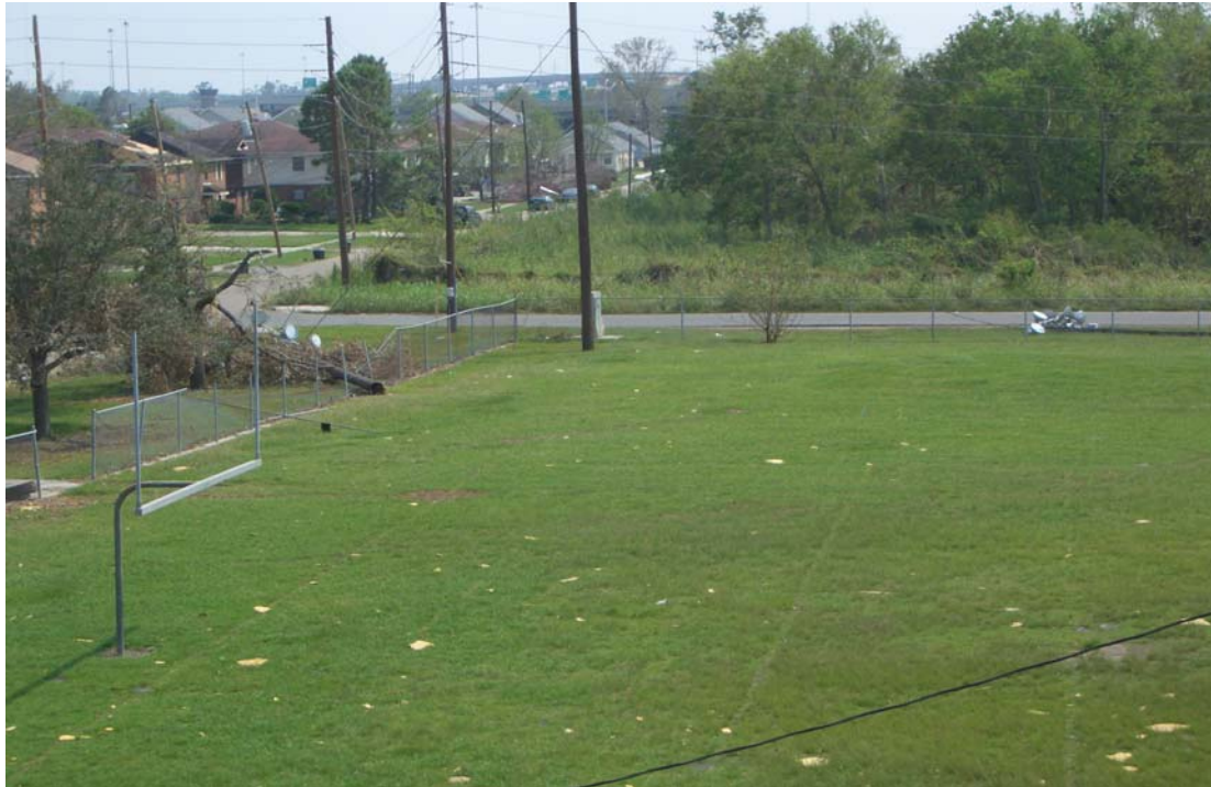
Tree and lights down on football field