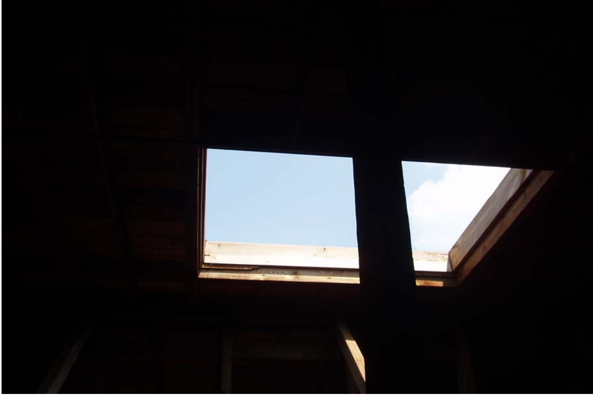
Skylight blown out