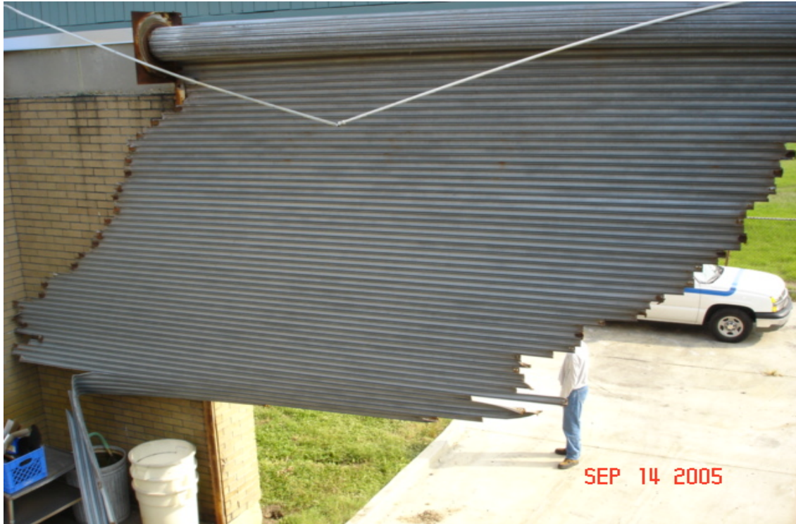
Roll up door damaged, delivery dock