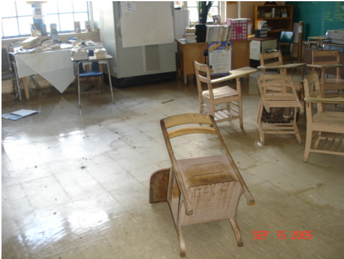
Water in classroom