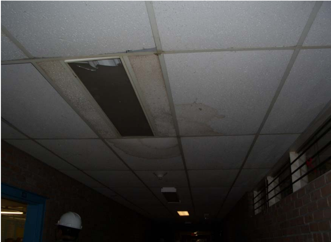
Water damage to ceiling in hallway