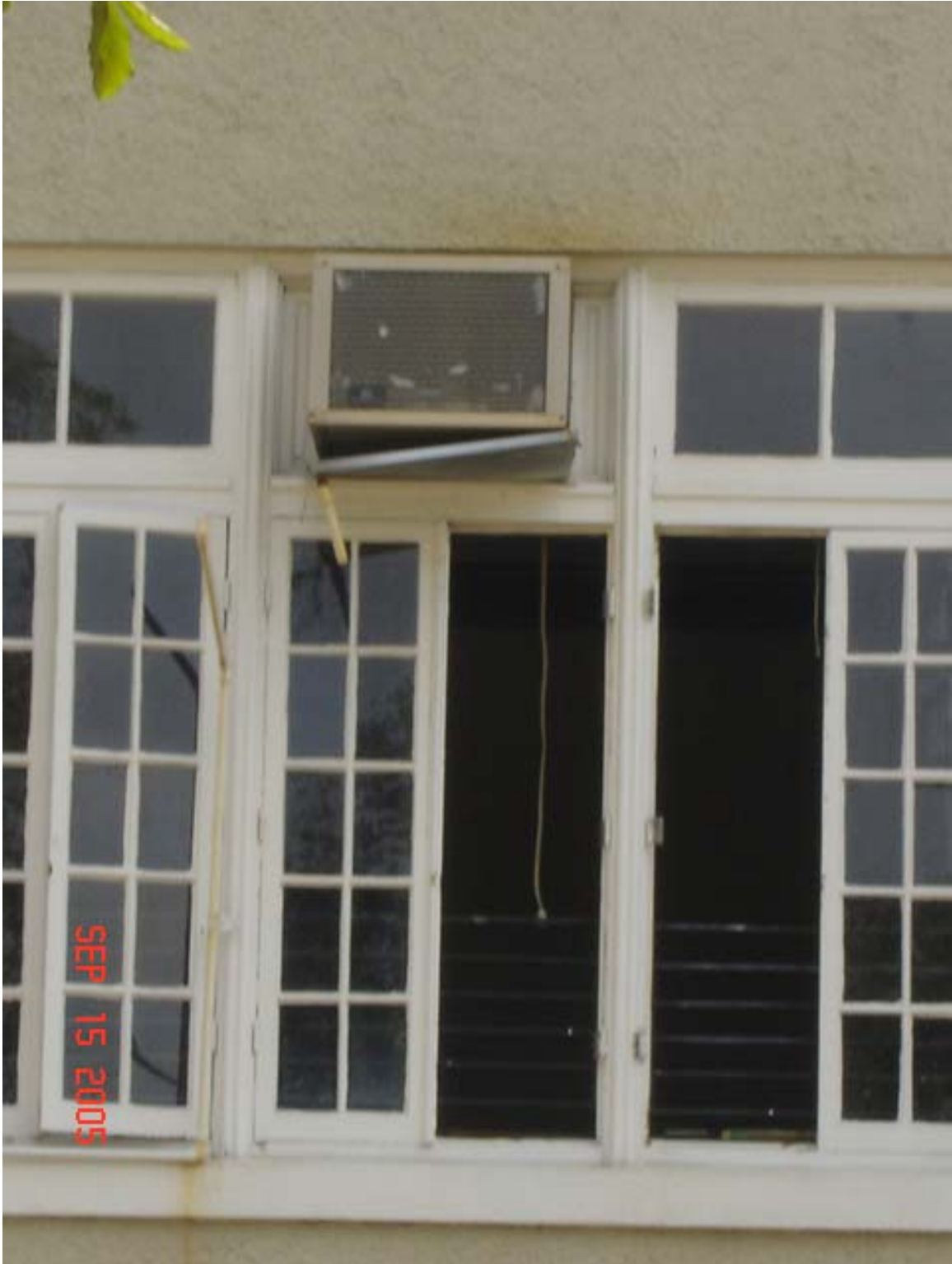
Windows torn off, second story – found mostly intact on ground