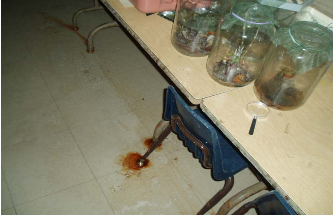
Water damage on floor