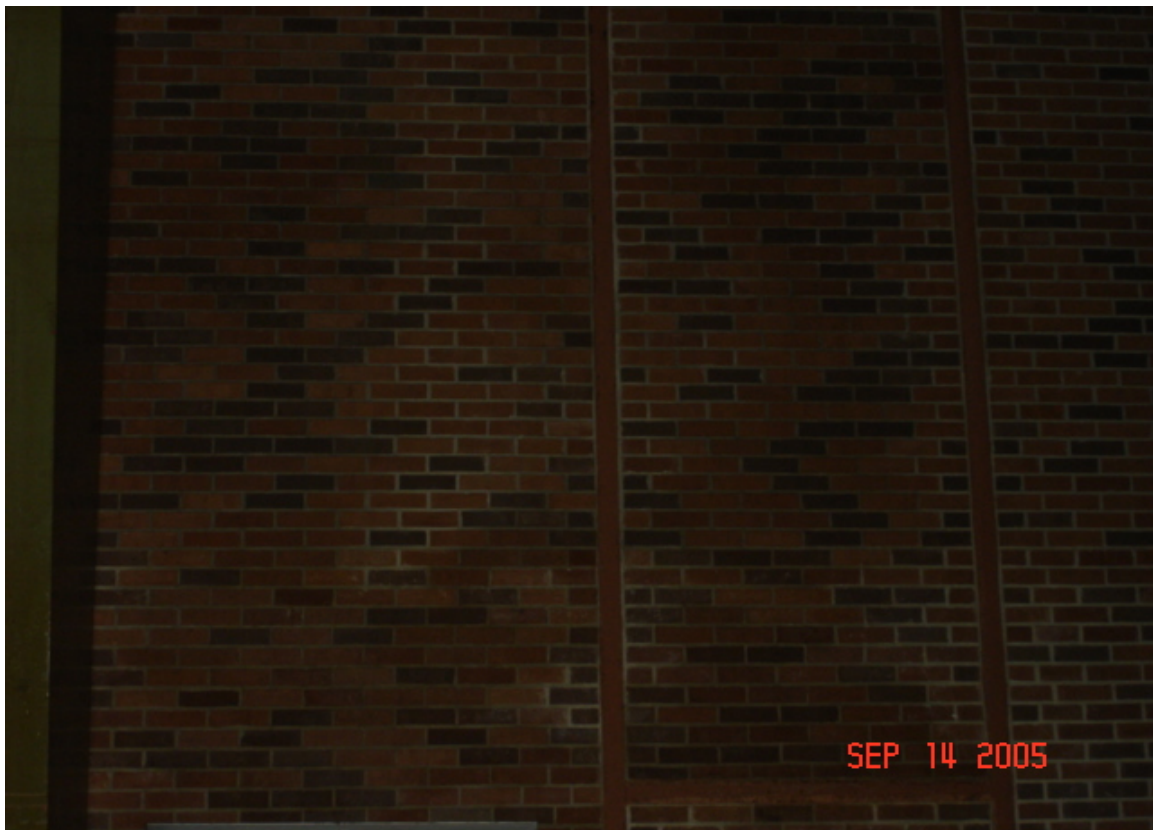
Moisture in auditorium wall