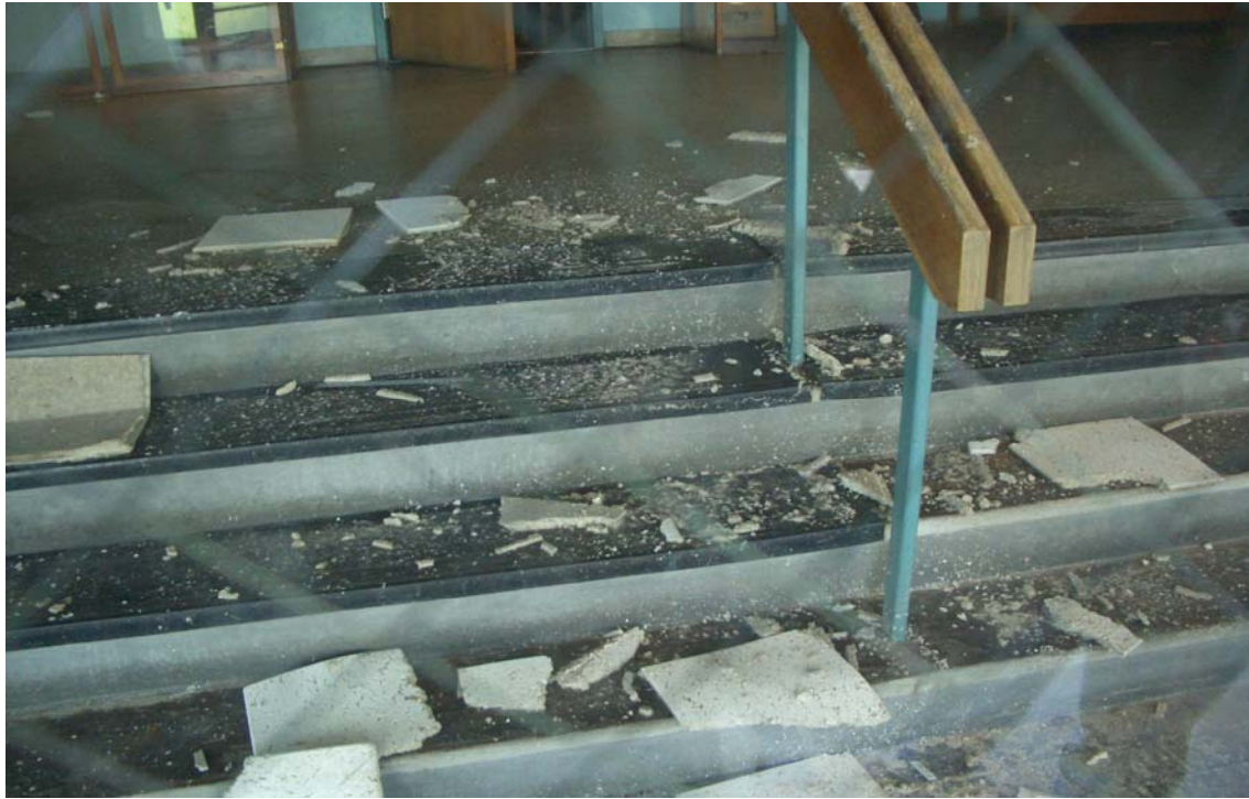
Ceiling tile down in entranceway of auditorium