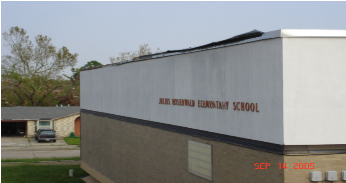
Flashing damage, cafeteria roof