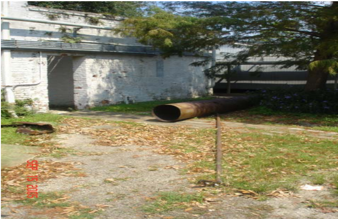
Boiler stack blown off boiler building