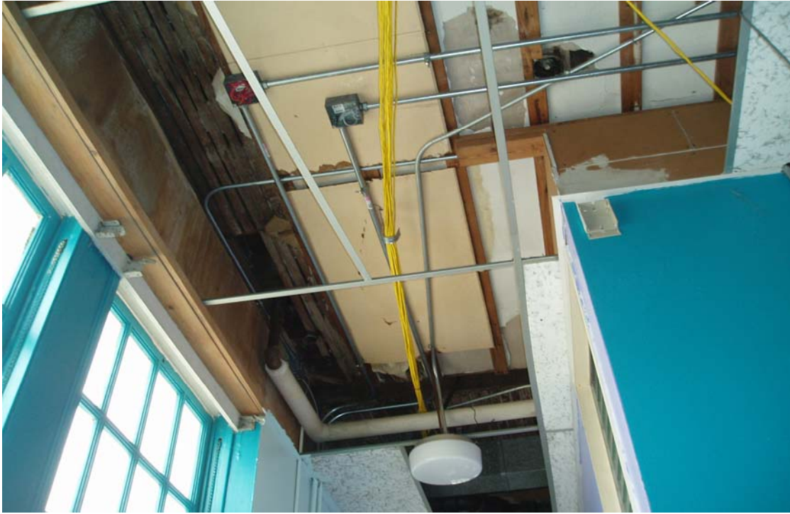
Ceiling and water damage