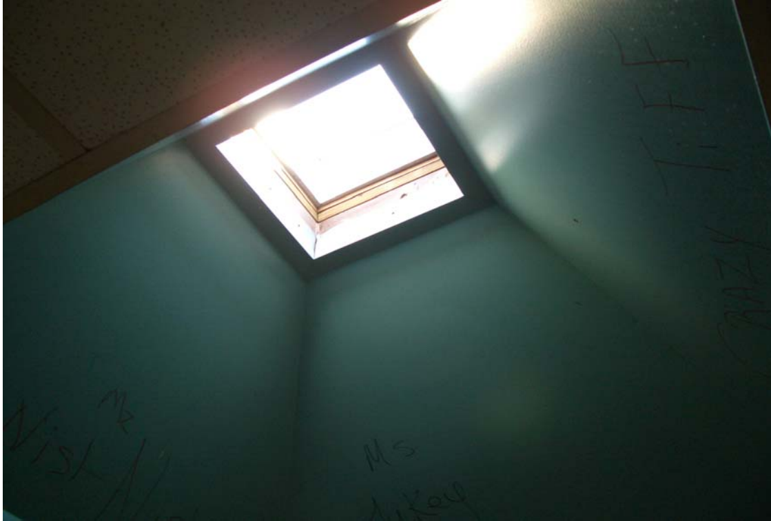
Skylight blown out in hallway