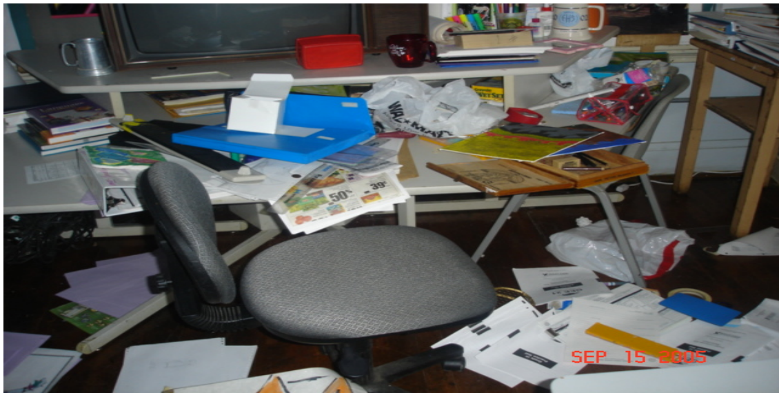
Vandalism in classroom