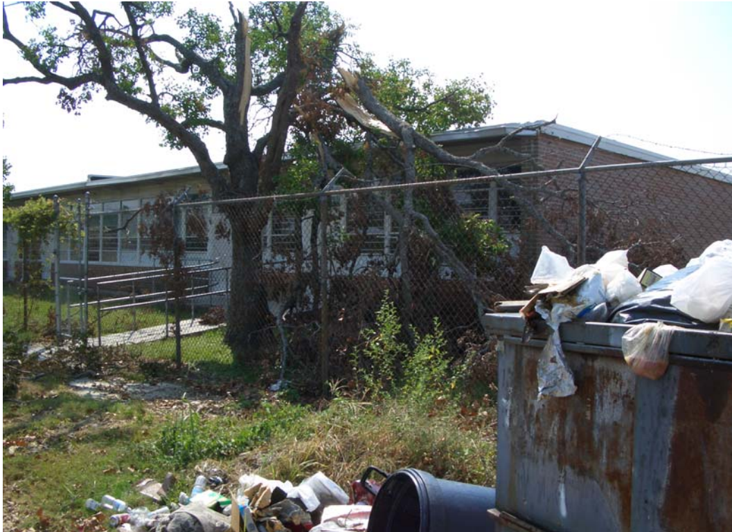
Tree down on side of building