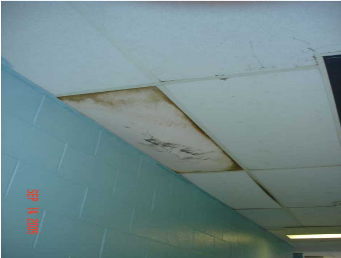
Moisture & mold in ceiling tile