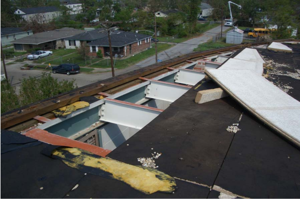
Damage to roof of auditorium