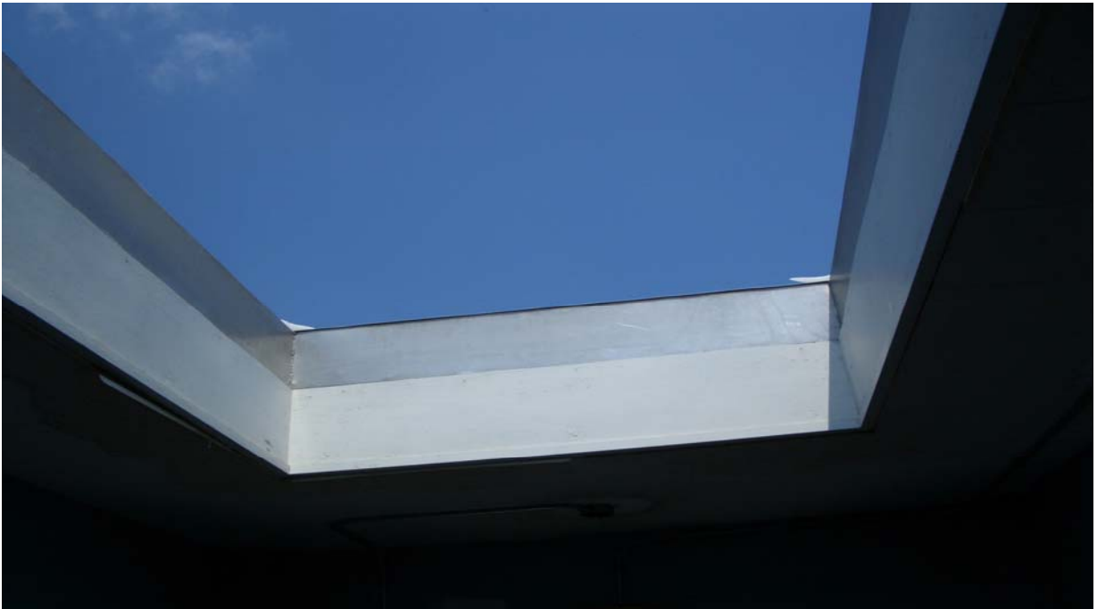
Blown out skylight