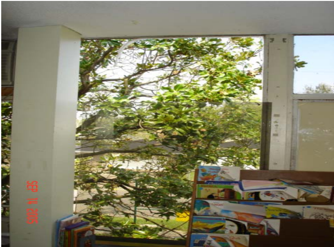
Window broken by fallen tree