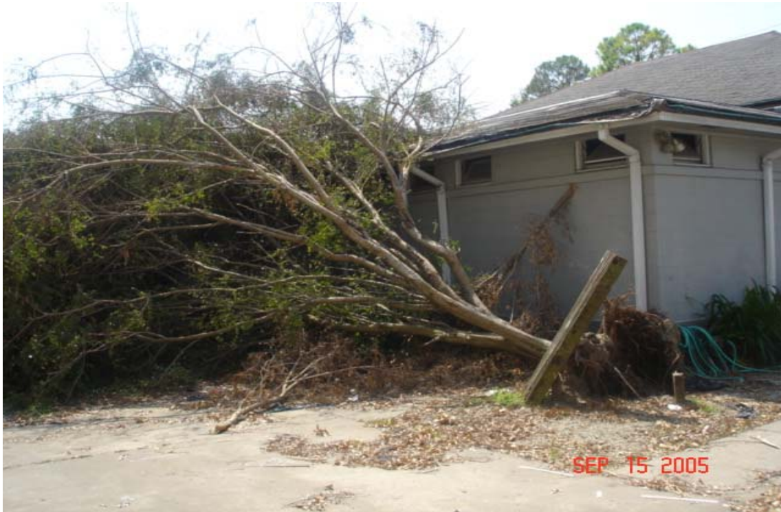
Tree down between buildings