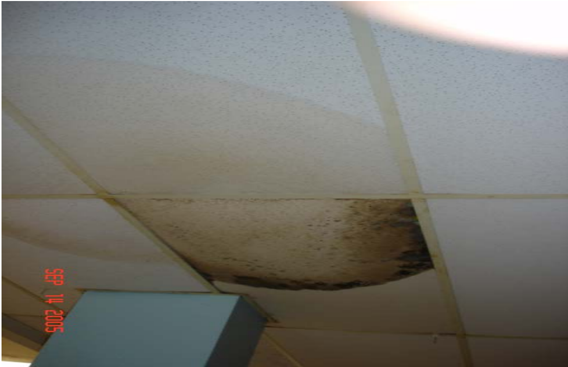
Moisture & mold in ceiling tile, vestibule