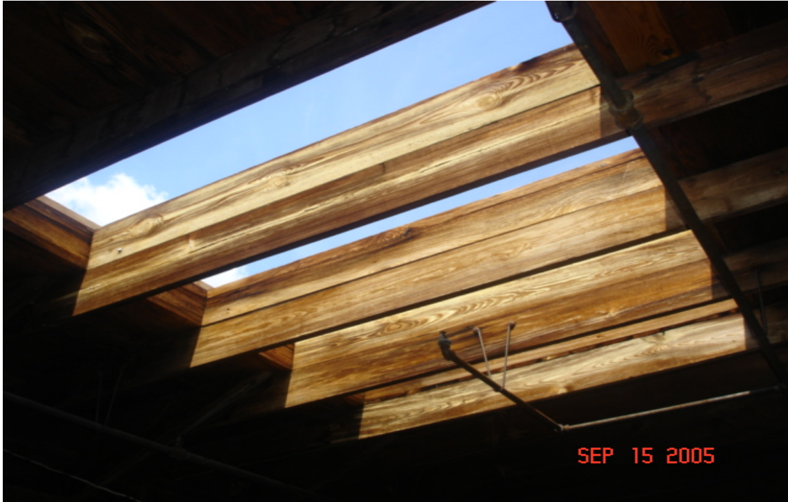
Prior location of skylight in previous picture