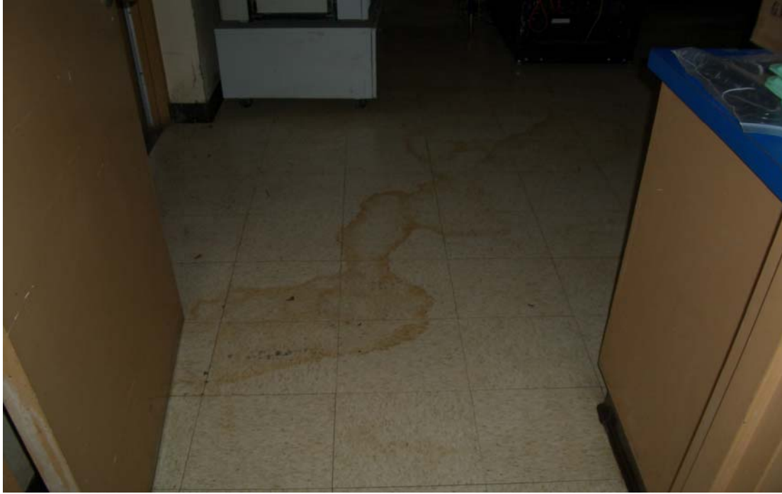
Water damage on floor