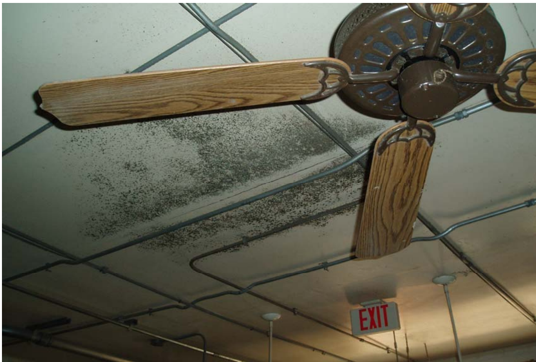
Evidence of water damage and mold