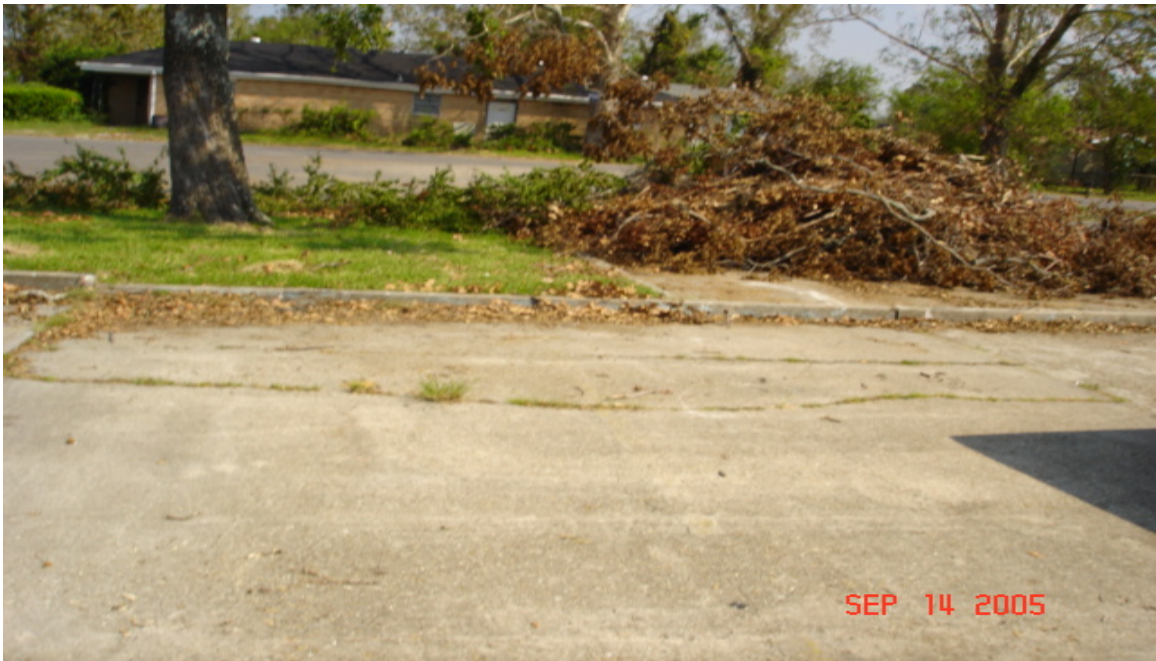
Tree down, front of building