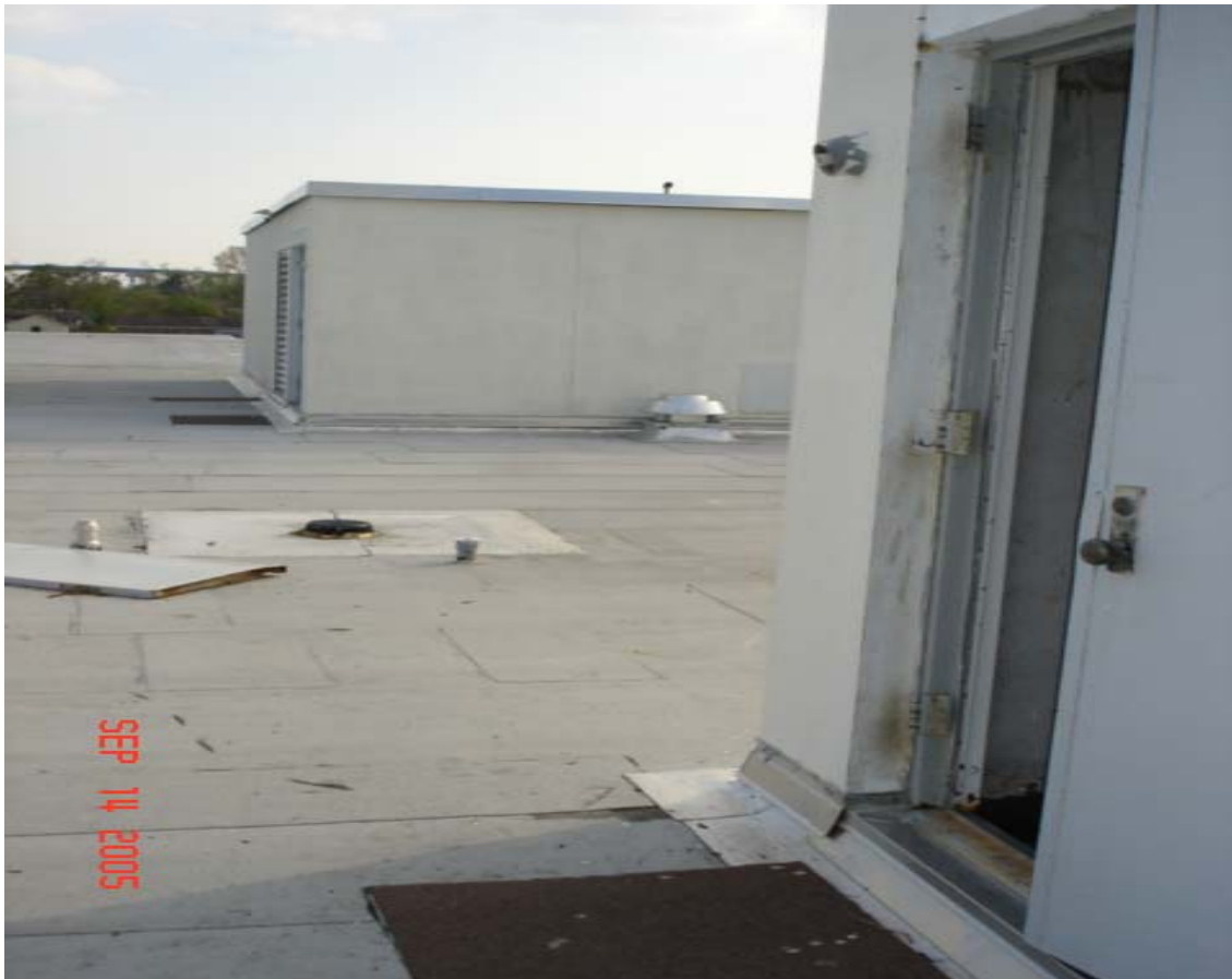
Door torn off mechanical penthouse