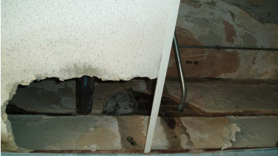
Water damage to floor