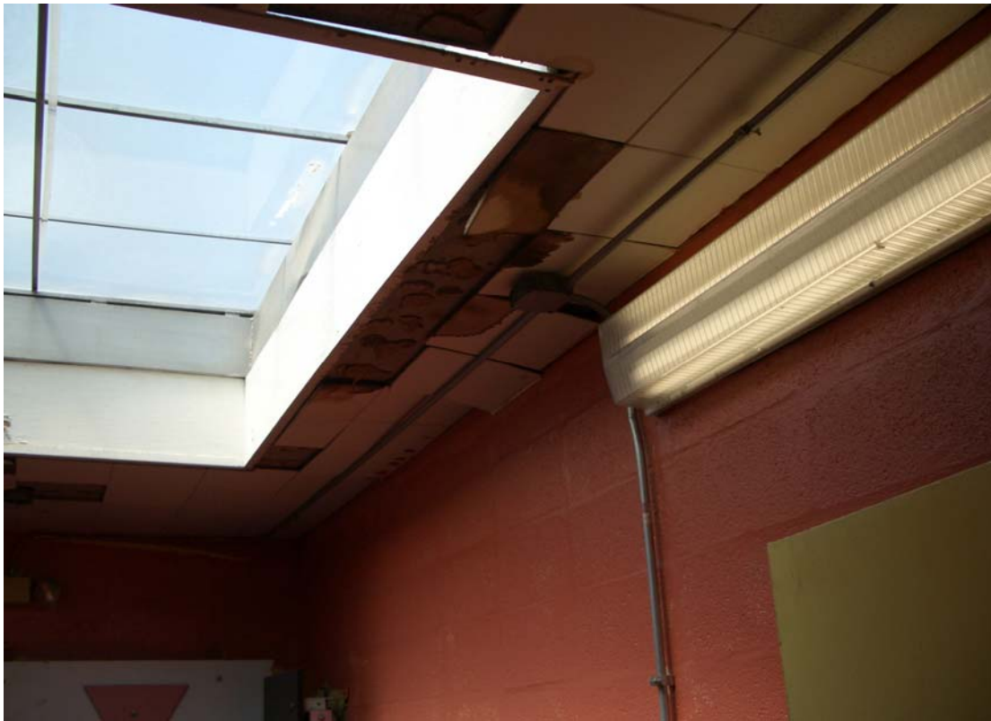
Ceiling tile water damage in stairwell