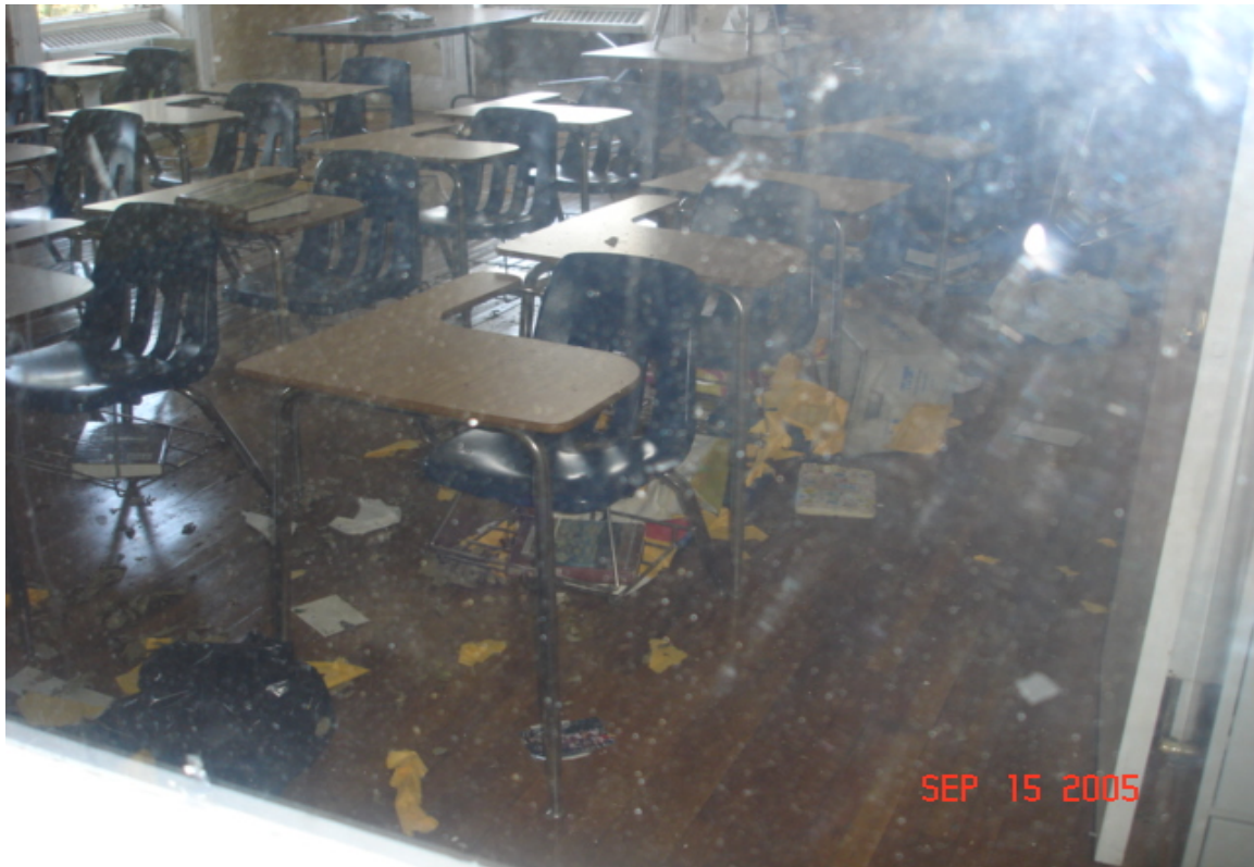
Classroom damage, front of building