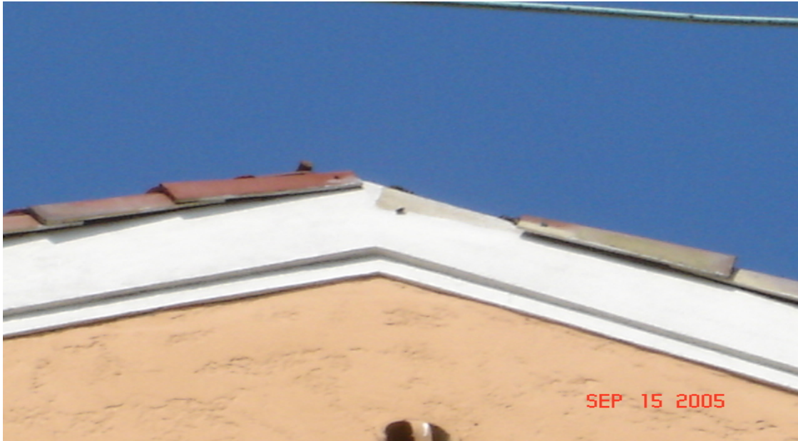
Roof tile damage