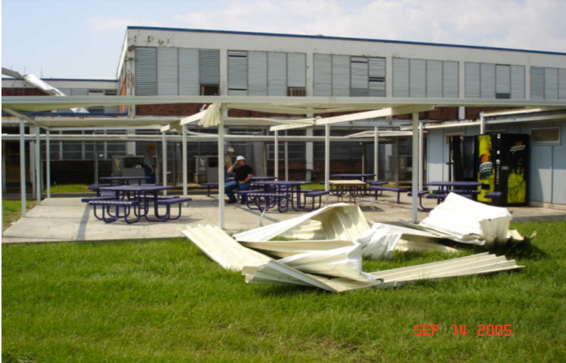
Canopy torn off