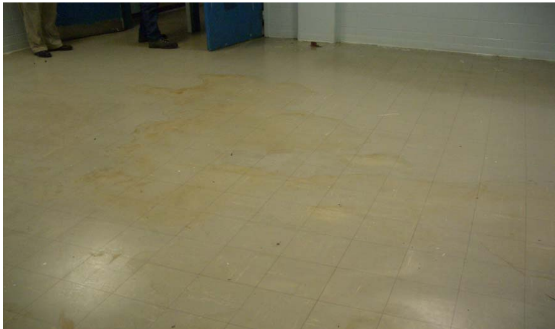
Water damage on floor by entranceway