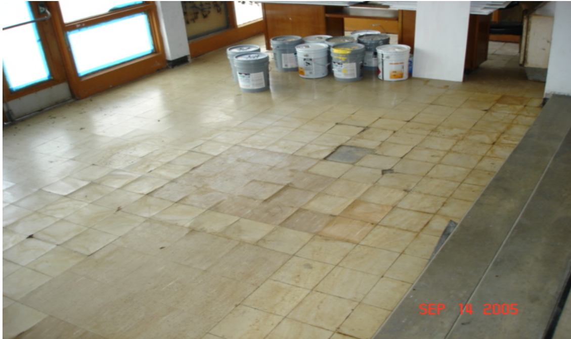
Floor damage entry to auditorium