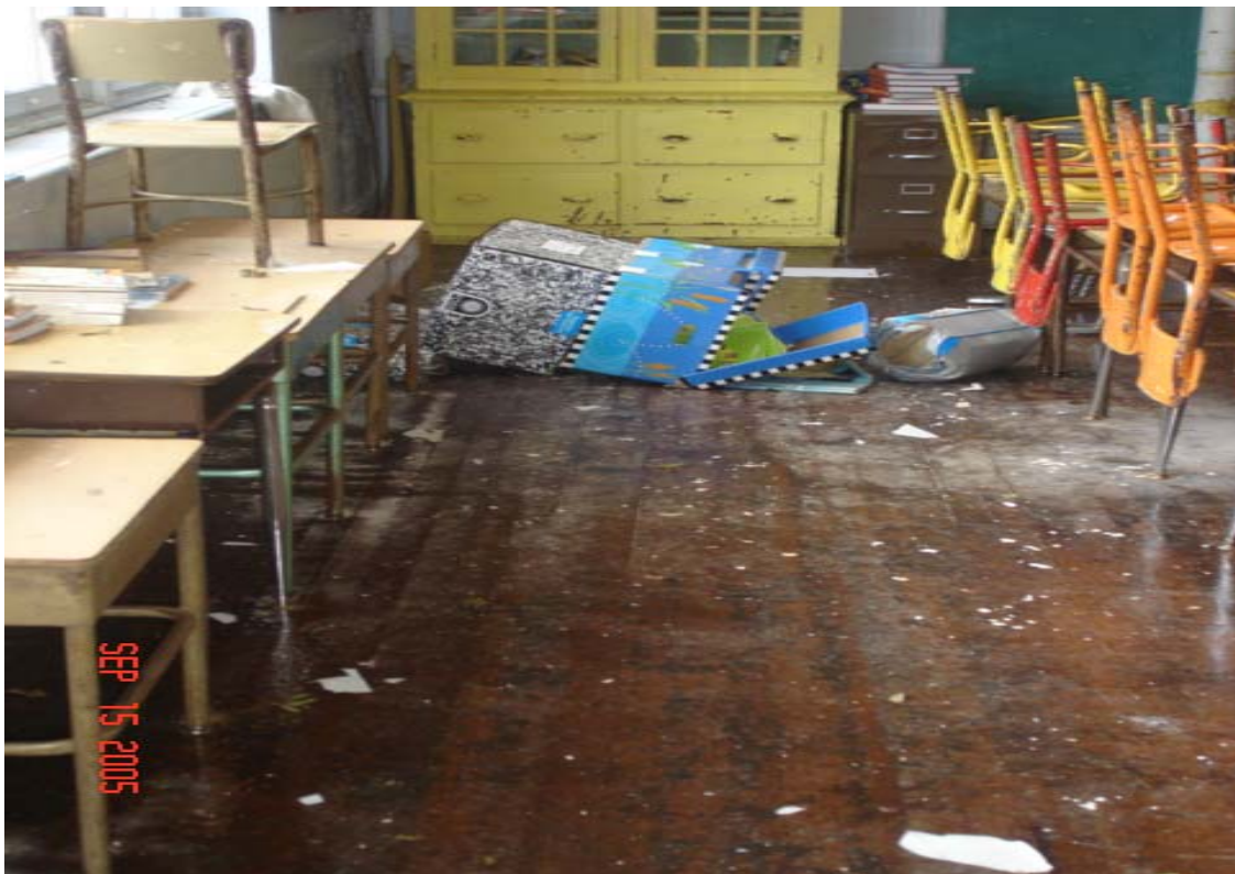
Damage & debris in classroom