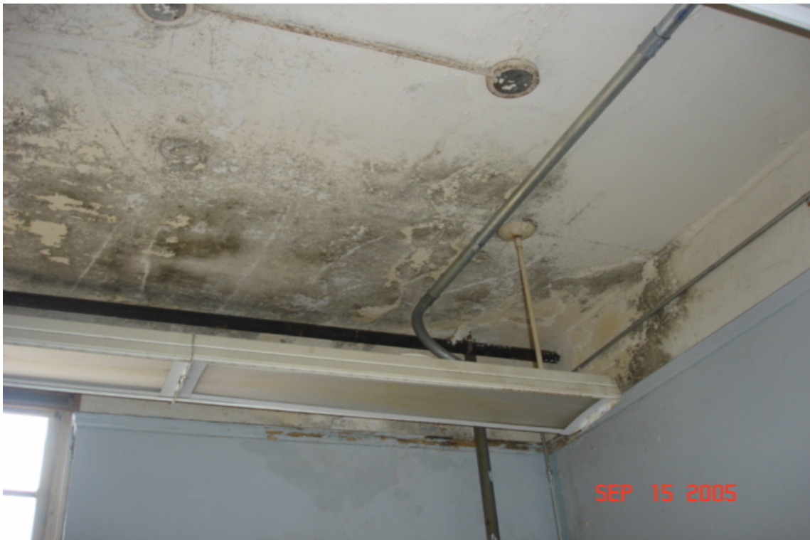
Moisture & mold, classroom ceiling