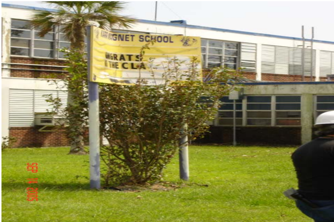
School sign damage