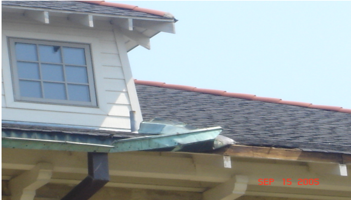
Roof fascia damage