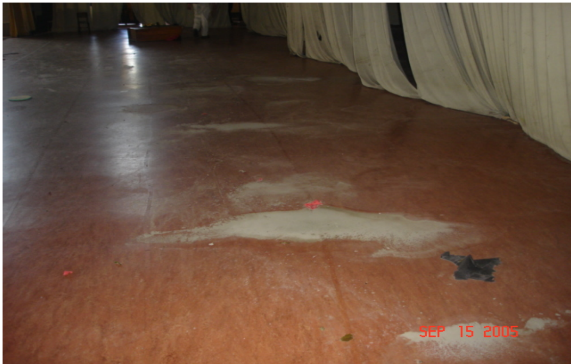
Stage floor damage