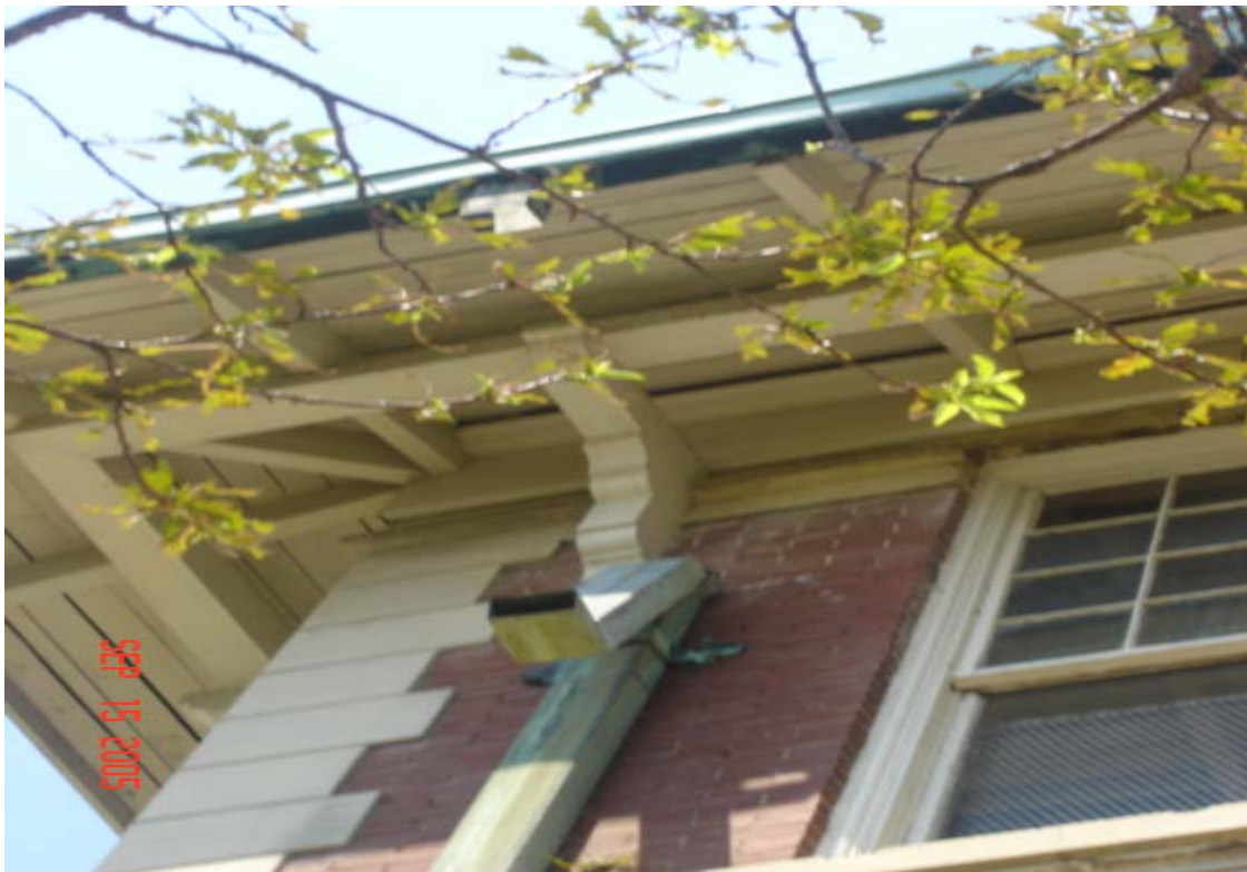
Downspout torn out of gutter