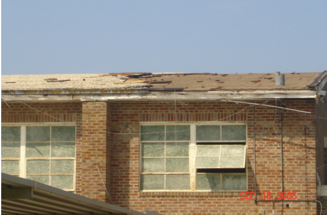
Gym roof damage