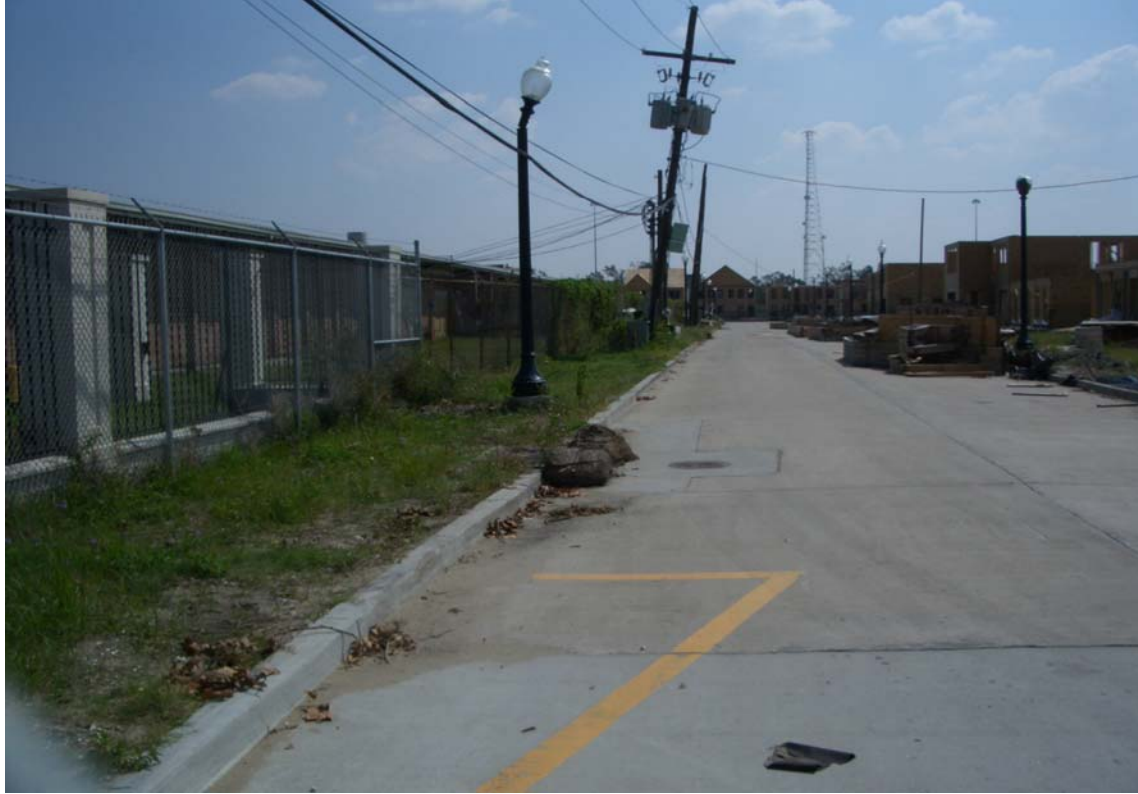
Utility pole and street light bent outside school fence