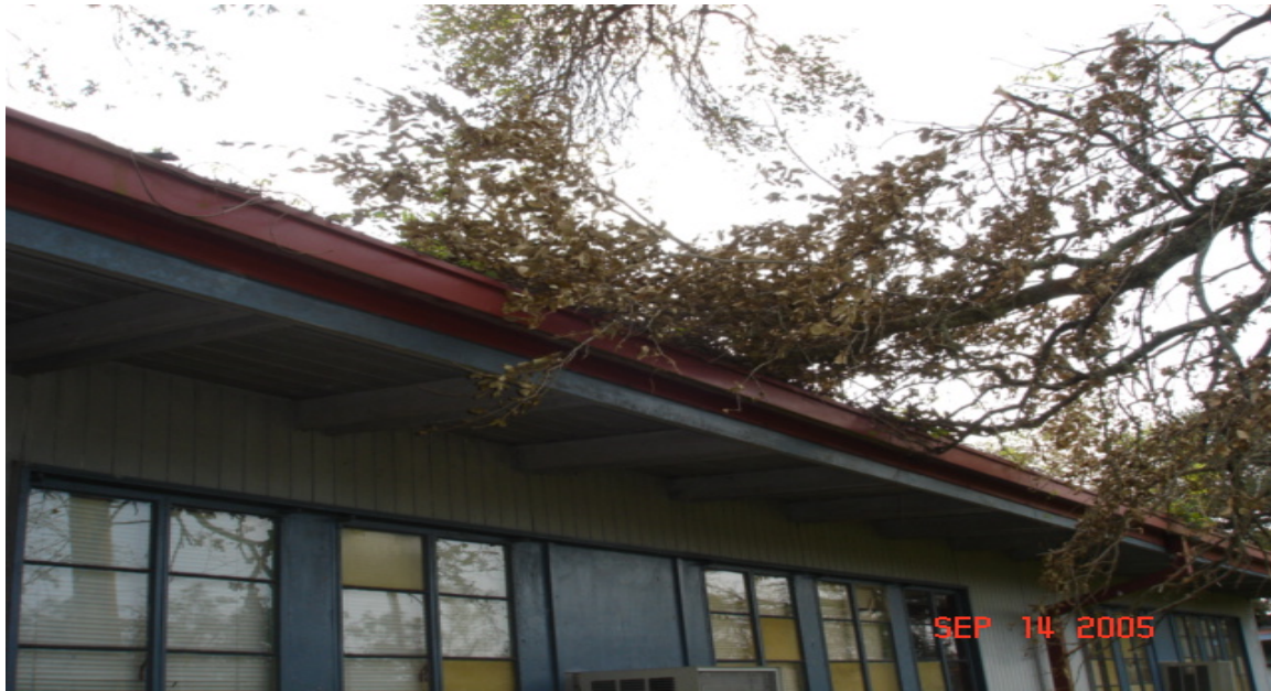
Tree limb on roof